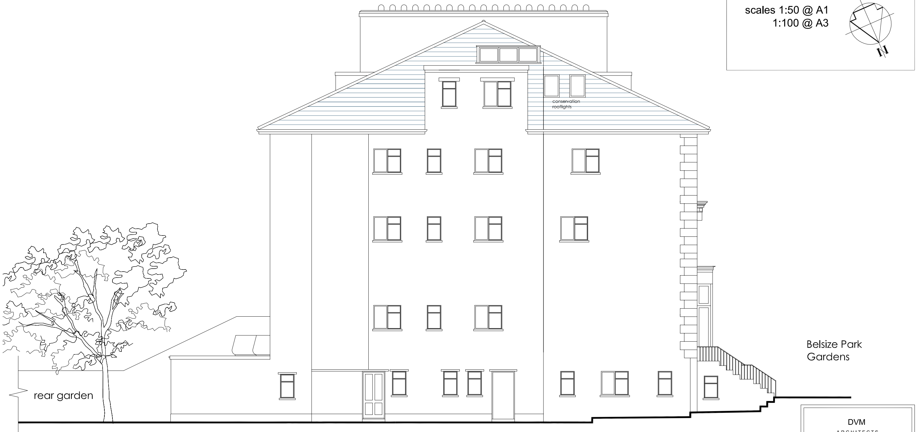
flank elevation (east)