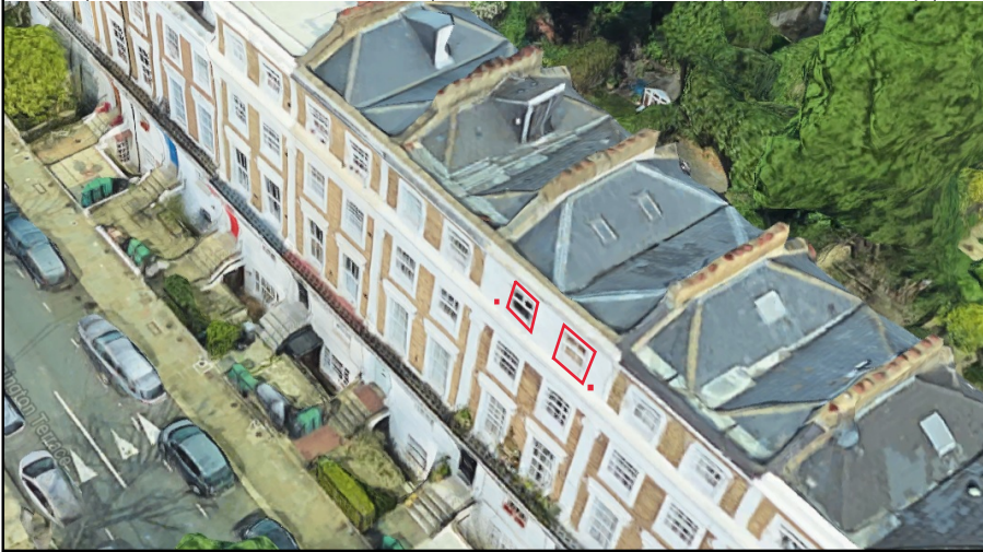
Note: Indicative location of proposed secondary glazing and sonair grilles in relation to wider streetscape.

HS2 Ltd accept no responsibility for any circumstances, which arise from the reproduction of this map after alteration, amendment or abbreviation or if it issued in part or issued incomplete in any way. © Crown copyright and database rights 2019 OS 100049190 Derived from (. . .cite the scale of the BGS data used. . .) scale BGS Digital Data under licence 2011/111 BP British Geological Survey. © NERC. Contains Environment Agency information © Environment Agency and database right. © Crown copyright material is reproduced with the permission of Land Registry under delegated authority from the Controller of HMSO. This material was last updated on [date] and may not be copied, distributed, sold or published without the formal permission of Land Registry and Ordnance Survey. Only an official copy of a title plan or register obtained from the Land Registry may be used for legal or other official purposes. © Crown Copyright Ordnance Survey.