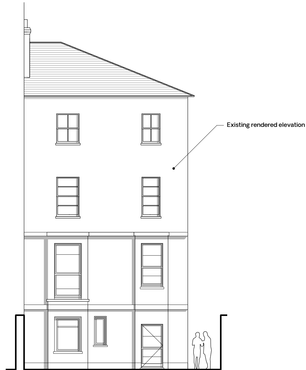
2 Existing Rear Elevation Scale: 1:100