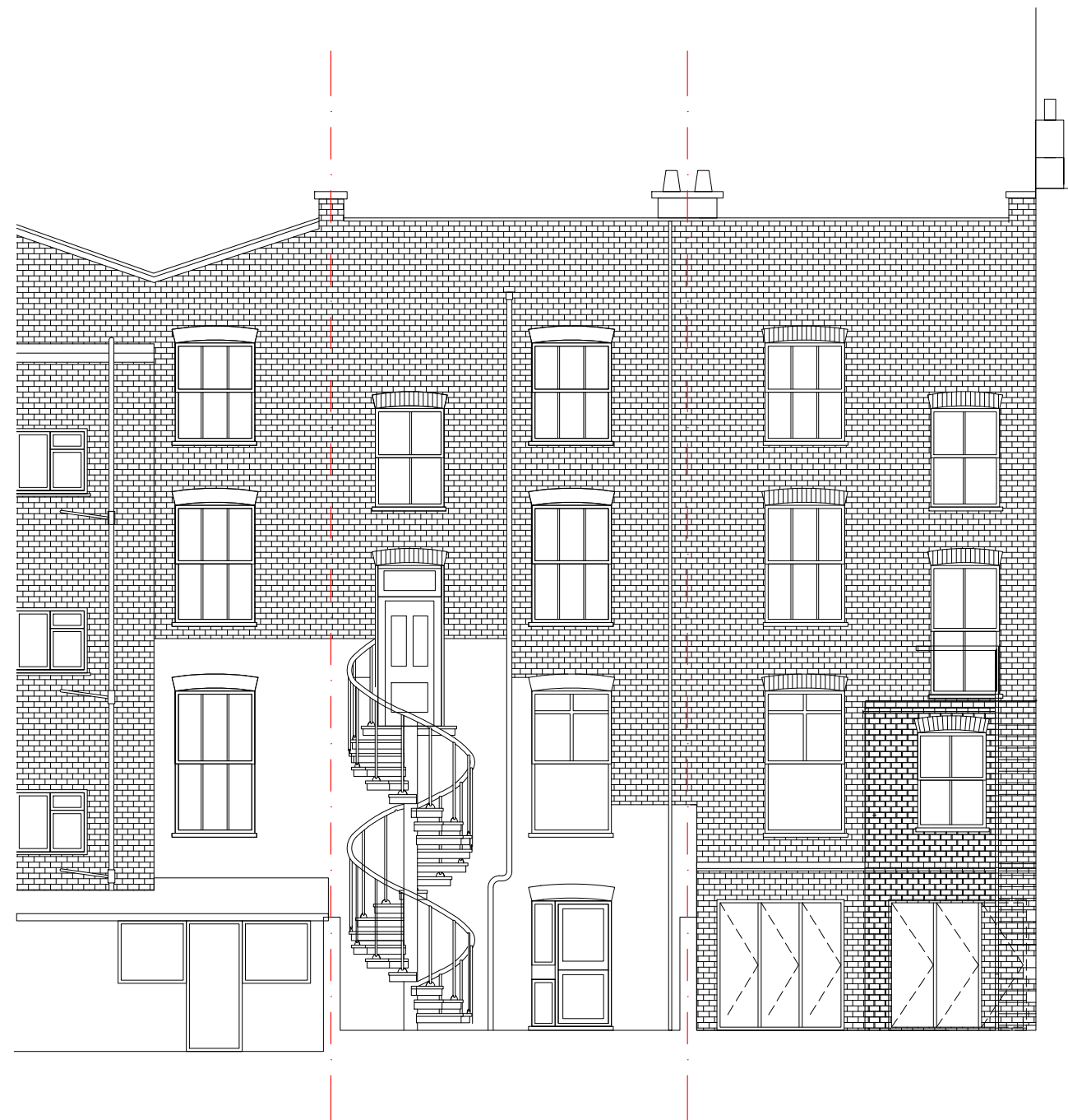
02 EXISTING REAR ELEVATION 1:200 @ A3