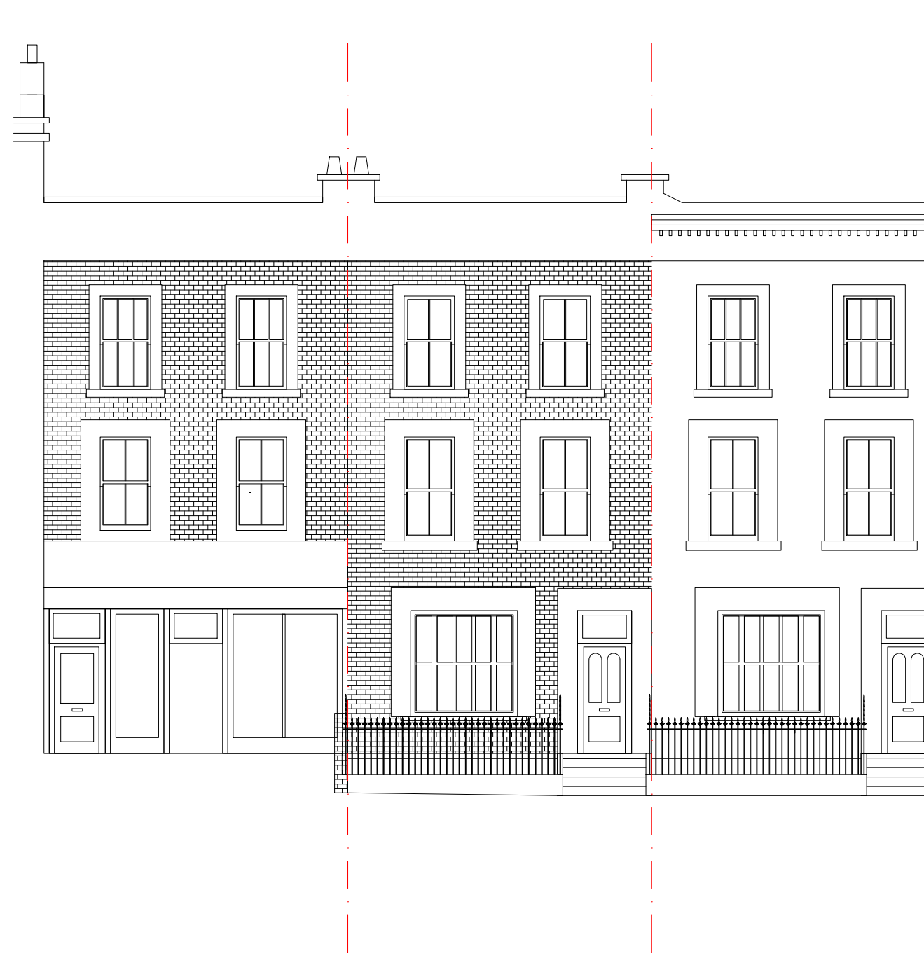
01 EXISTING FRONT ELEVATION 1:200 @ A3