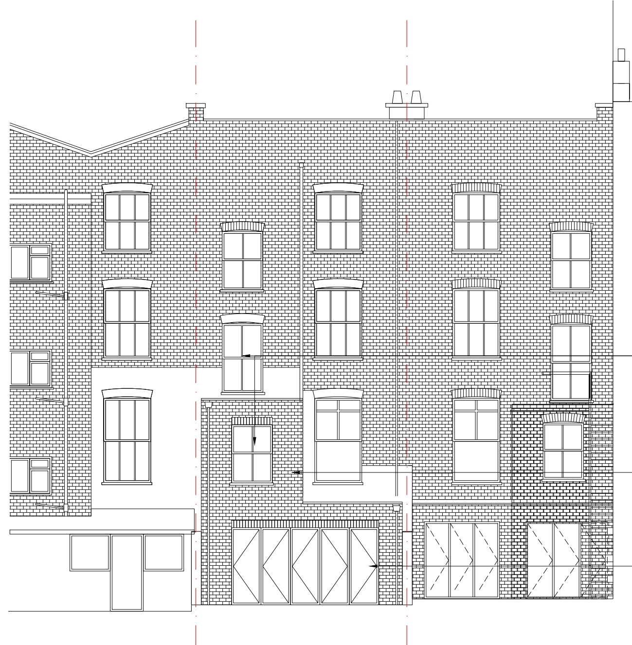
04 PROPOSED REAR ELEVATION 1:200 @ A3

NEW DOUBLE GLAZED TIMBER SASH WINDOWS. FINISH: WHITE TO MATCH EXISTING WINDOWS ON REAR FACADE.