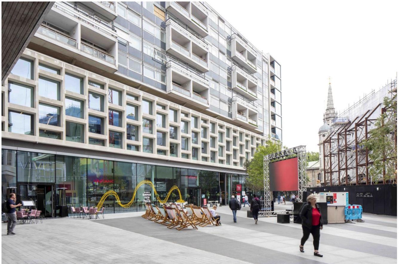
Centre Point House & Vapiano restaurant

Centre Point is a Grade II listed building. The Centre Point complex includes three listed elements: the Tower, the link, and Centre Point House (also known as East Block). Retail unit 05 of Centre Point House is let to the applicant, Vapiano UK and has been granted Listed Building Consent (Ref 2017/4222/L) for restaurant use (Class A3). The granted works have been completed and the restaurant is open and trading since December 2018.