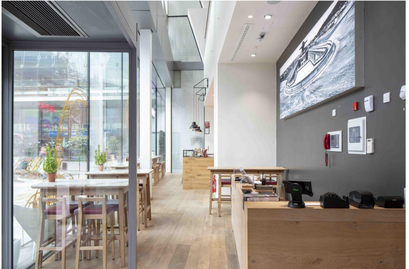
Existing ground floor reception desk and bar LHS to the main entrance