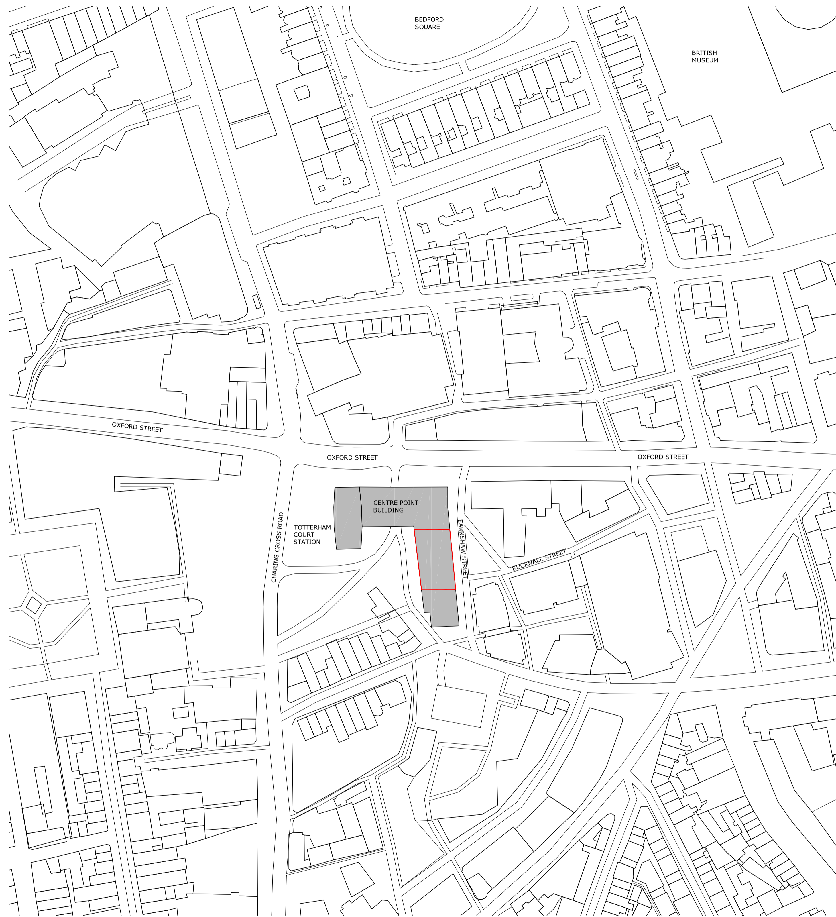
1 LOCATION PLAN 1:1250 @ A1