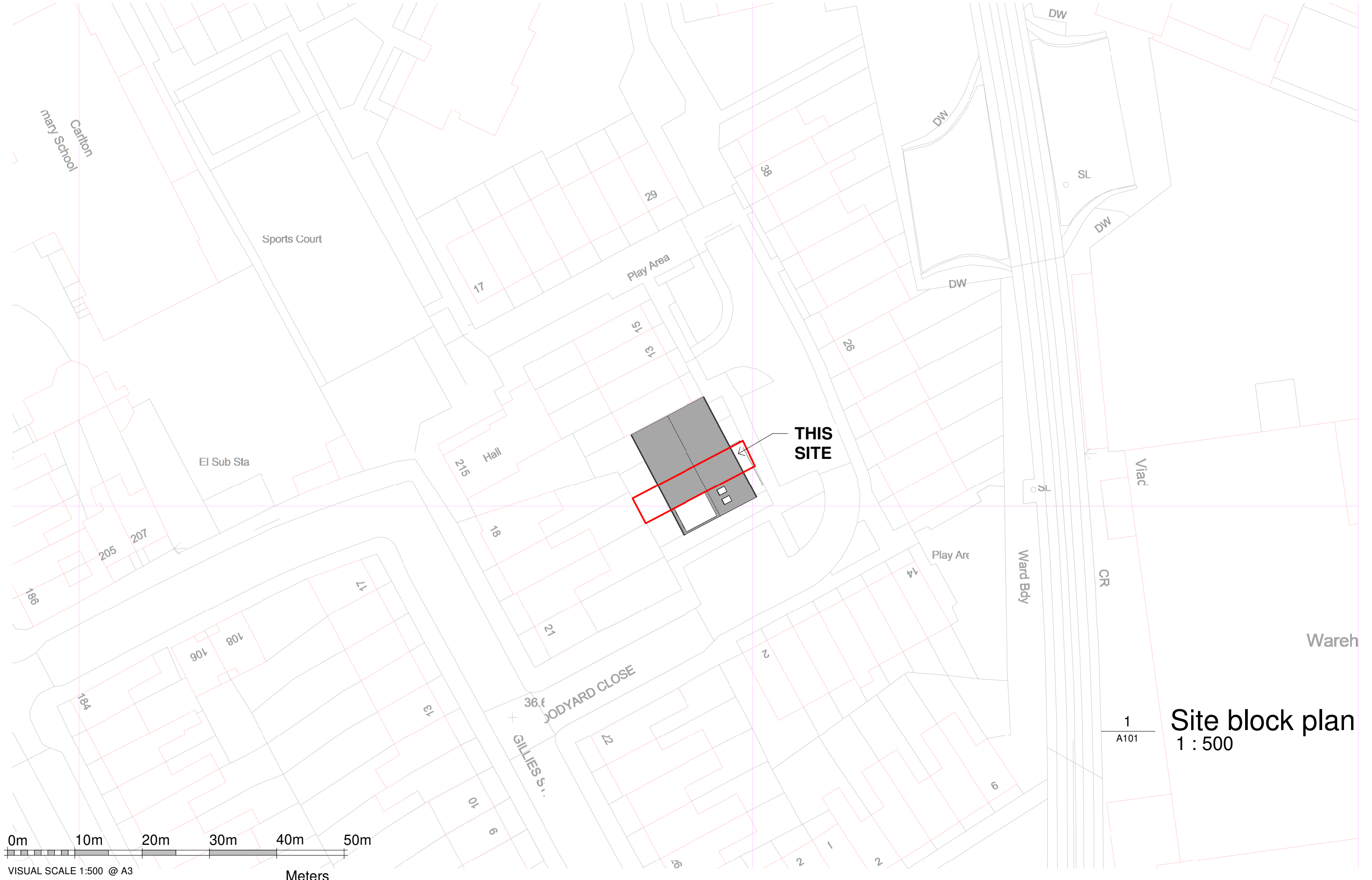
Site block plan 1 : 500