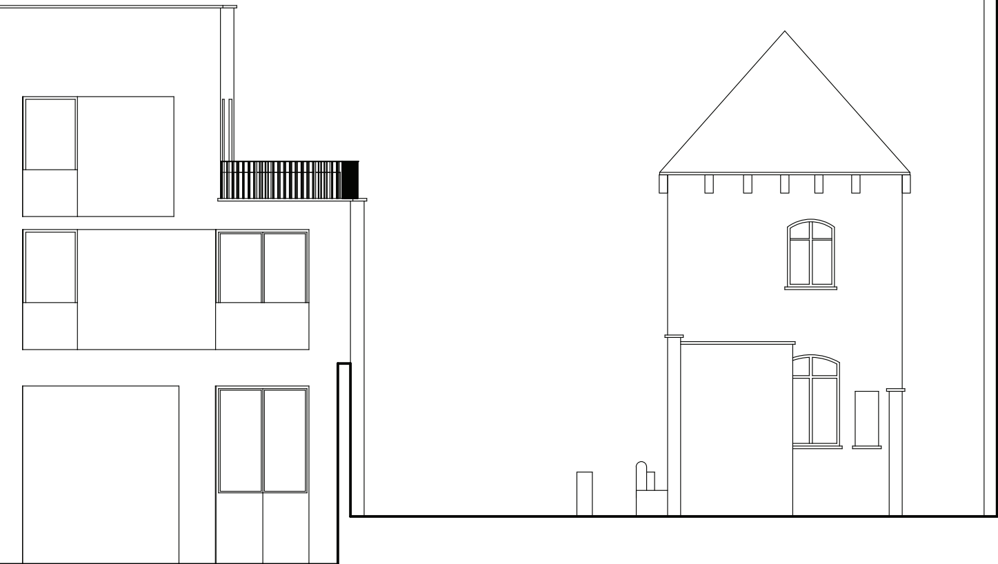
EXISTING NORTH ELEVATION 1:100

Notes: Any discrepancies on this drawing with other documents to be reported immediately to the Contract Administrator for clarification