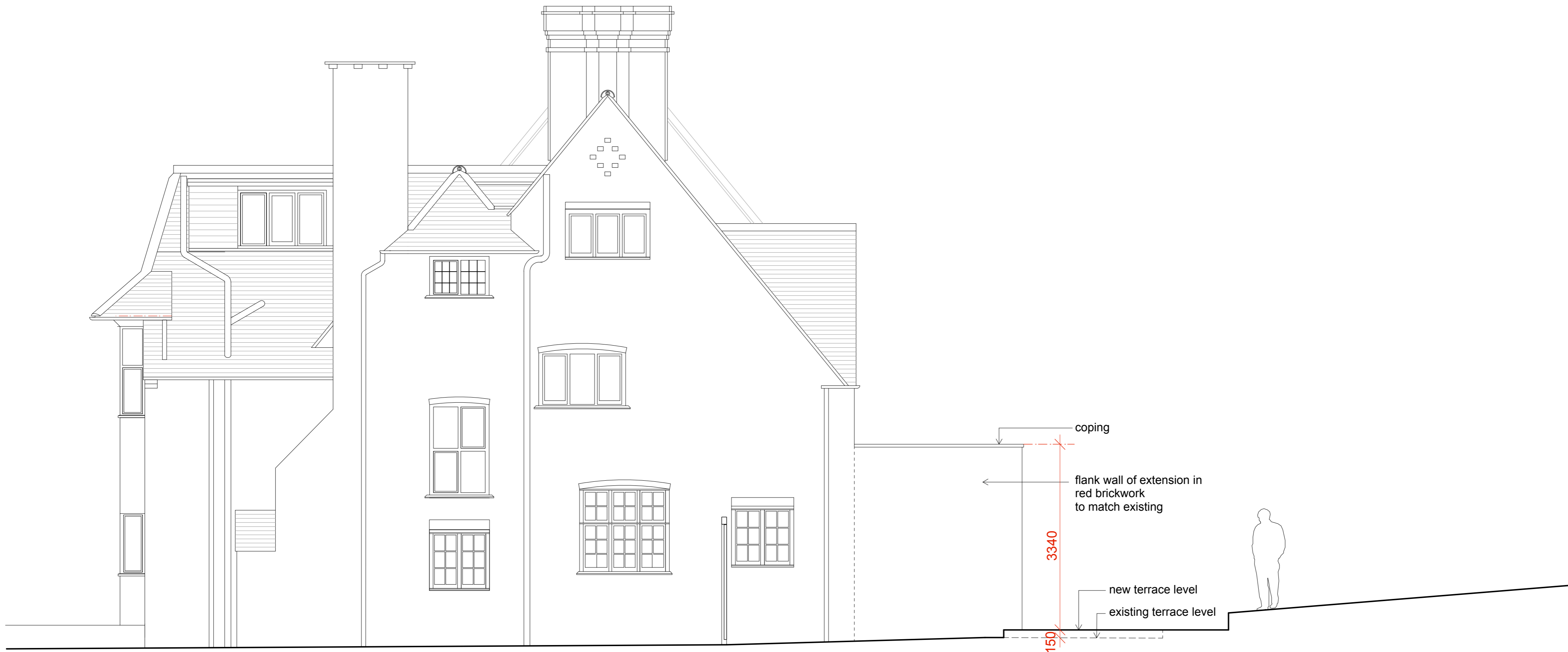
SIDE ELEVATION AS PROPOSED