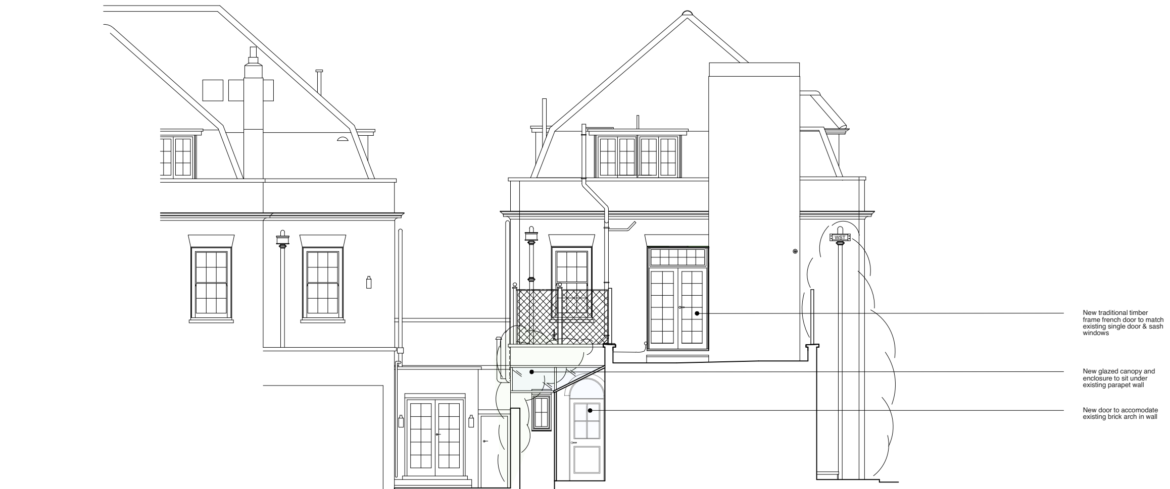
PROPOSED EAST ELEVATION - SIDE ELEVATION

New traditional timber frame french door to match existing single door & sash windows