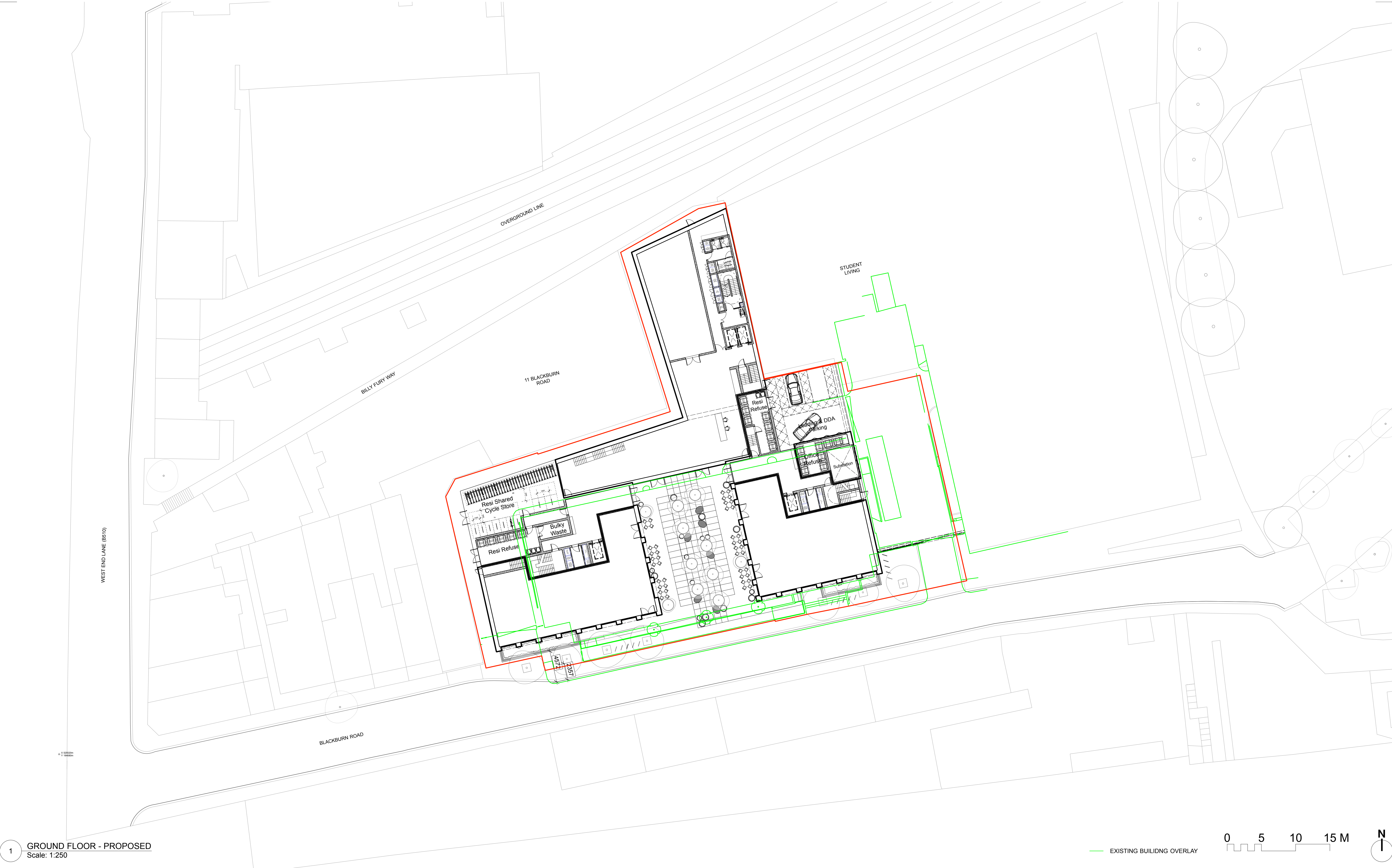
1 GROUND FLOOR - PROPOSED Scale: 1:250

GENERAL NOTES: Do not scale from this drawing. Check drawing on receipt and immediately report any discrepancies to the Architect. Verify all dimensions and levels on site prior to construction. The contents of this drawing are Stiff + Trevillion Architects Ltd copyright and shall not be re-used without their written permission.