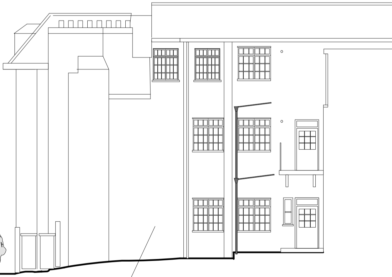
Existing courtyard elevation (Noth)

Note: window previously approved for this position