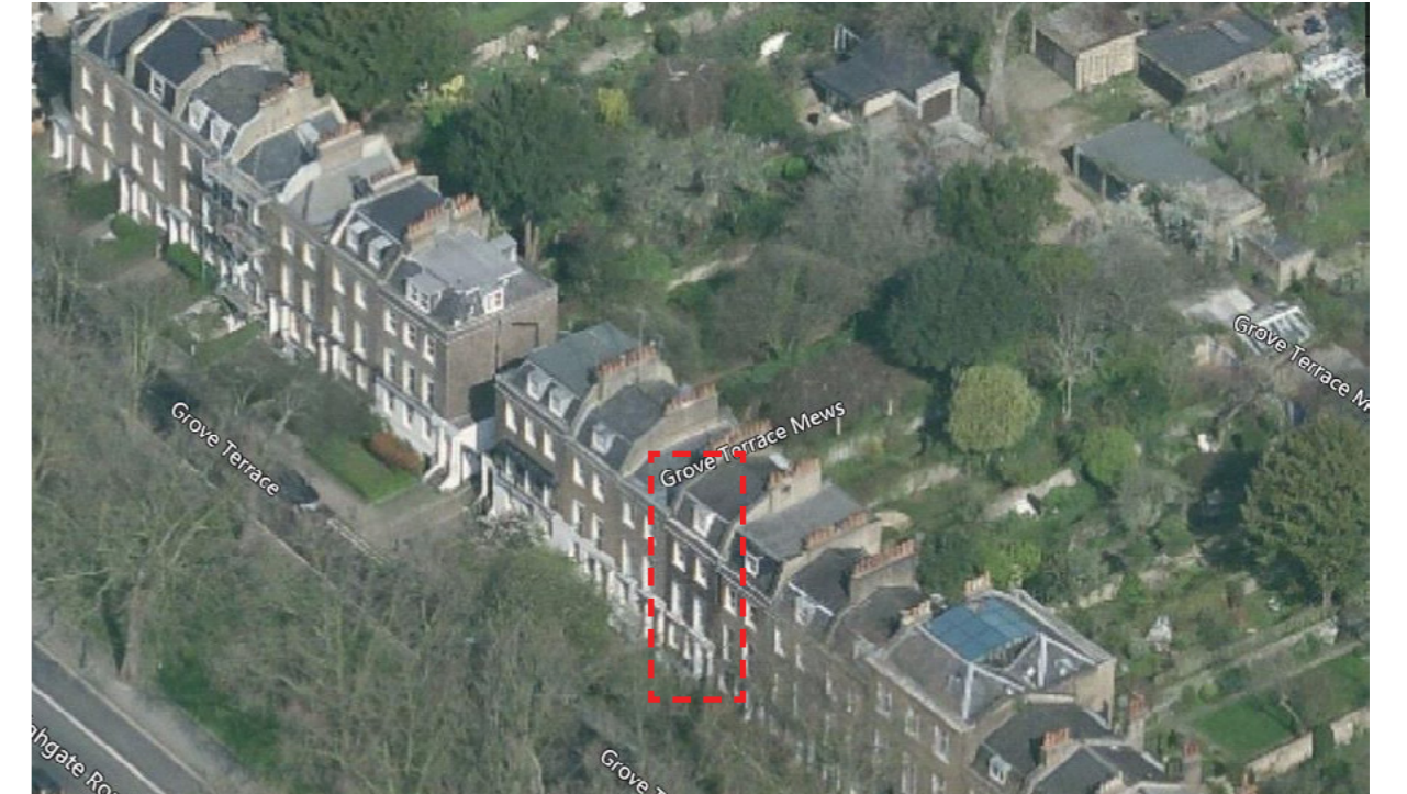
Aerial views of 18 Grove Terrace