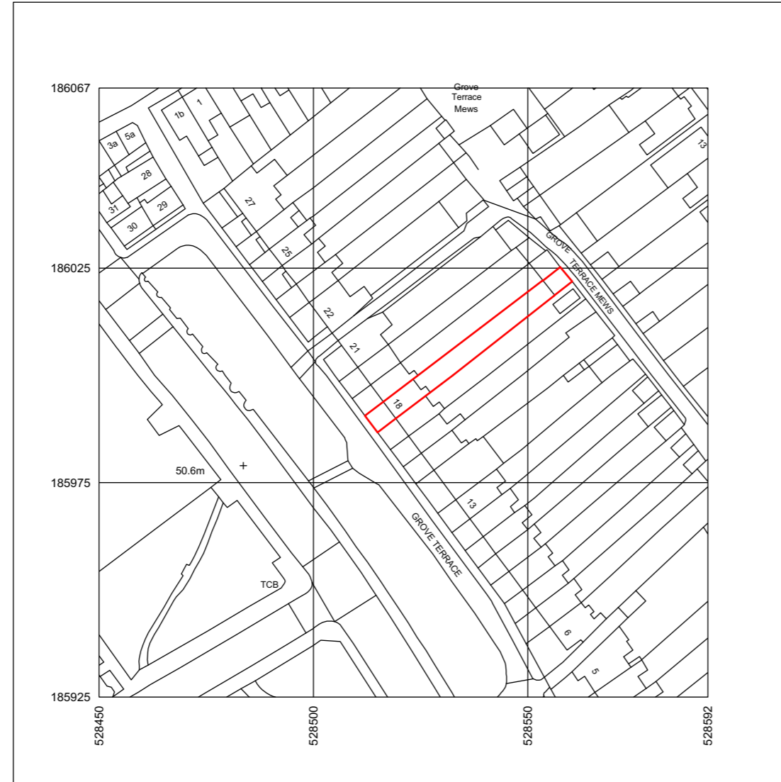
Existing Location Plan

18 Grove Terrace is located within the Dartmouth Park Conservation area.