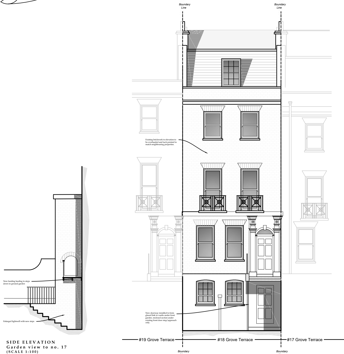
SIDE ELEVATION Garden view to no. 17 (SCALE 1:100)