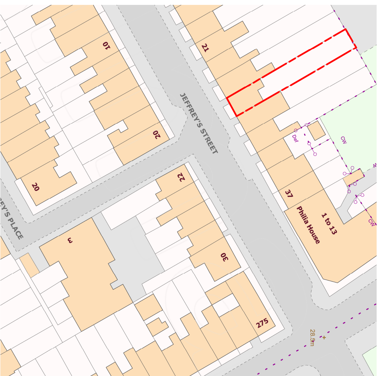
02 SITE PLAN SCALE: 1:500 @ A3

DISCLAIMER Dimensions to be verified on site. Only figured dimensions to be used and any discrepancies in dimensions are to be reported to Holloway and Holloway. No dimensions are to be scaled from printed drawings. Any areas indicated on this drawing are for guidance only. No responsibility is taken for their accuracy. There is a risk of injury or death in construction if works are not properly planned and supervised. The contractor must not undertake any elements of the work without first having carried out the necessary risk assessments and prepare detailed method statements.