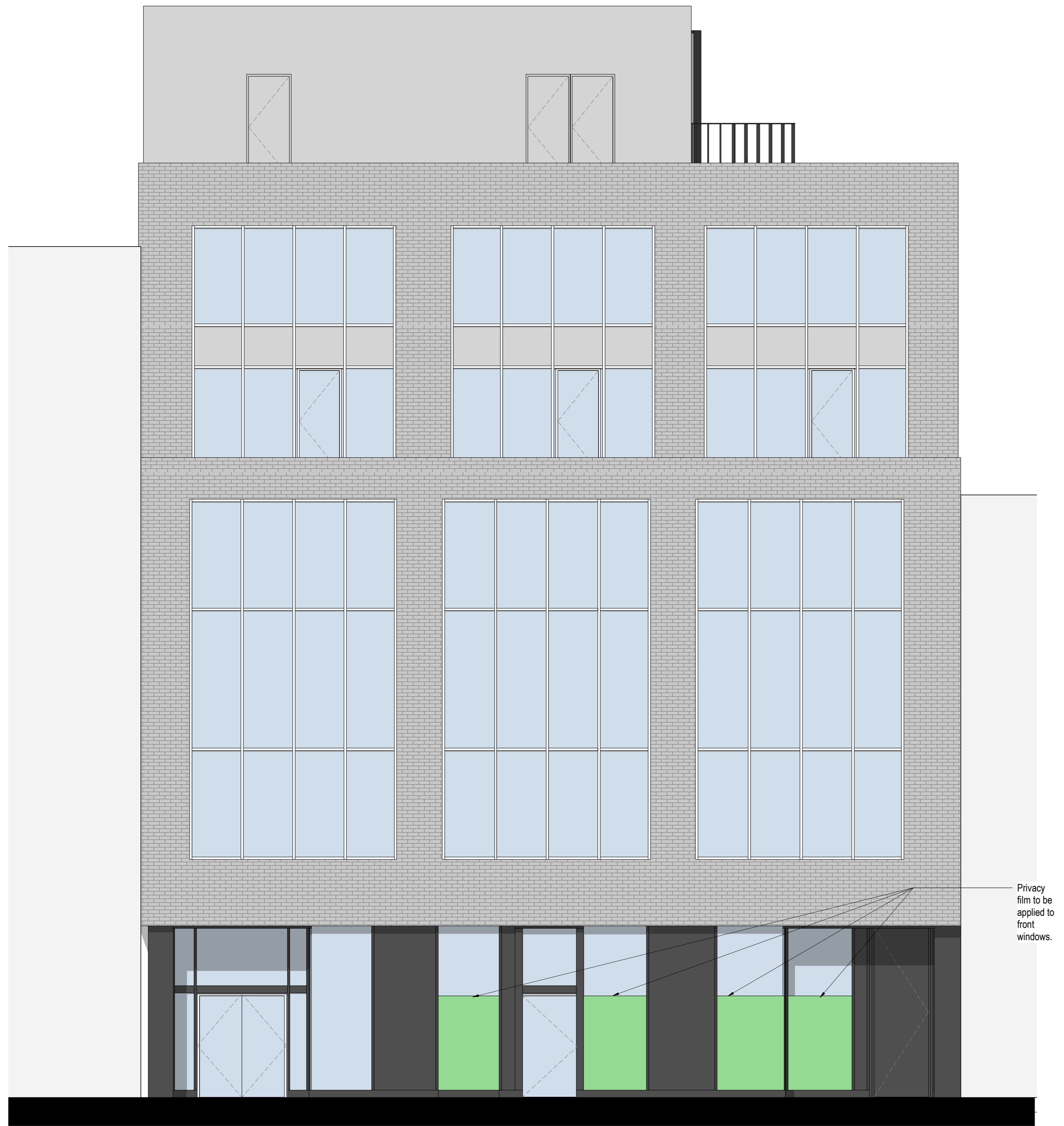
1 Proposed East Elevation 1:50