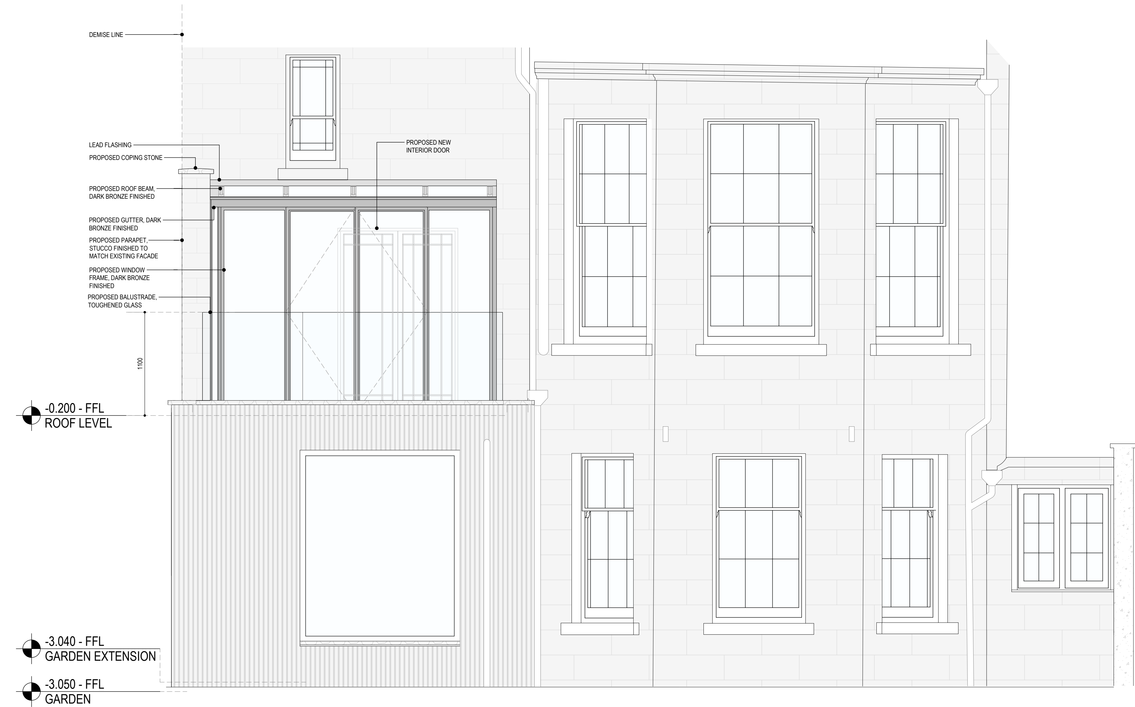
1 PROPOSED - REAR ELEVATION 01 SCALE: 1:50 @ A1 1:100 @ A3