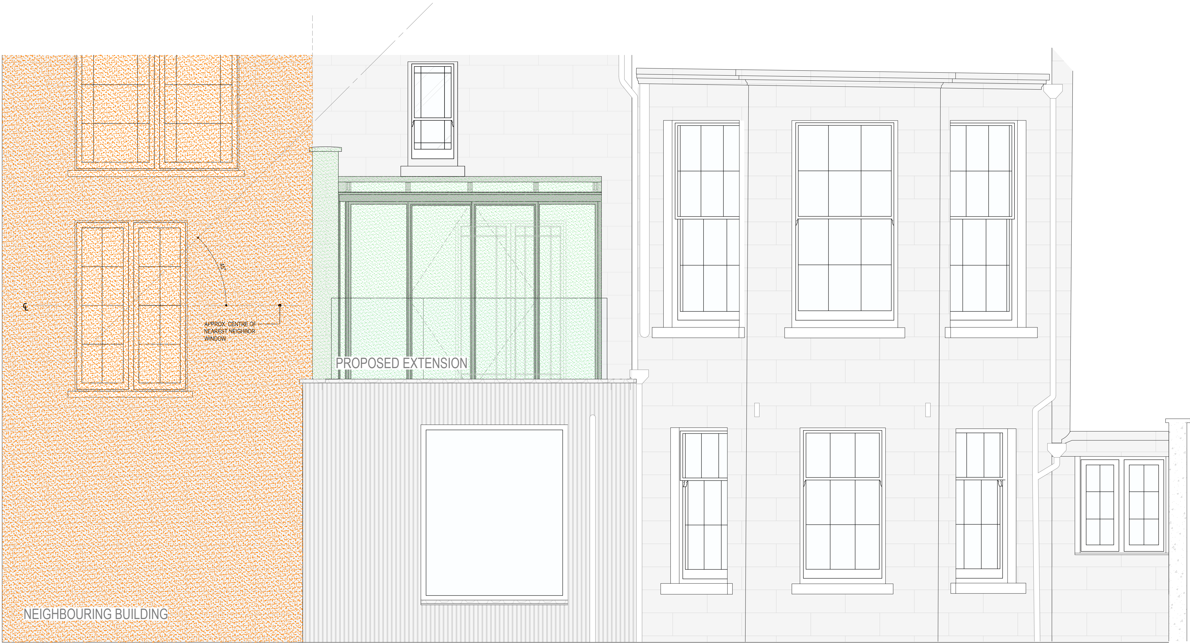
1 PROPOSED - REAR ELEVATION 01 SCALE: 1:50 @ A1 / 1:100 @ A3