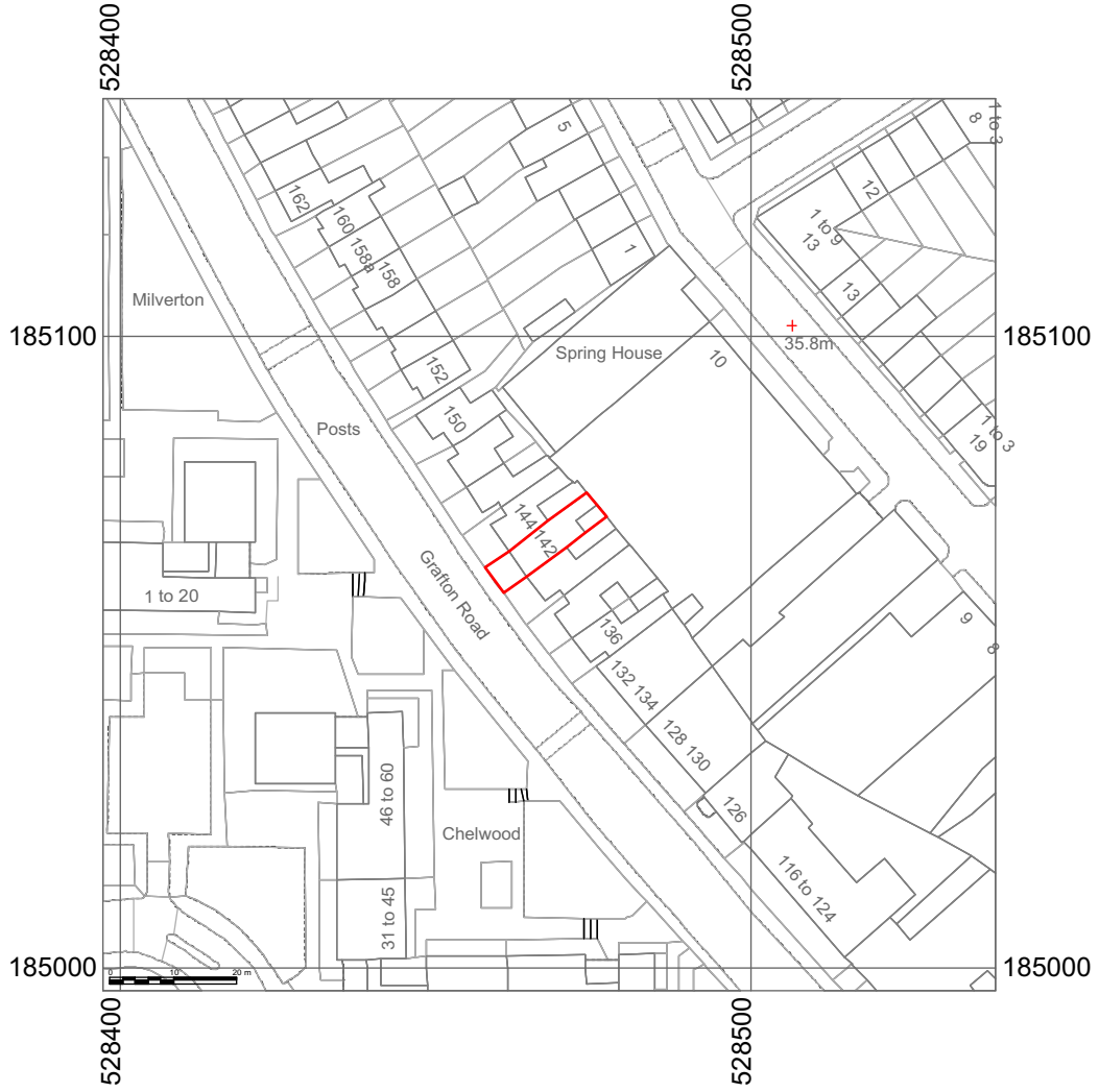
LOCATION PLAN - 1:1250