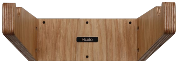
Maurad Bike Wall Mount by Huxlo

Six cycle spaces are proposed as labelled on the floor plans. The cyce spaces will be provided using bicycle wall mounts similar to the suggested product below, manufactured by Huxlo.