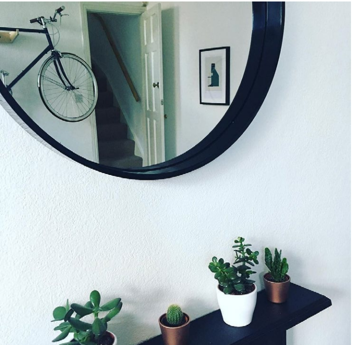
Example application images