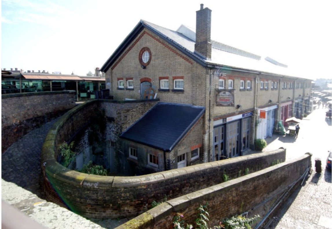
Figure 1 – Application site