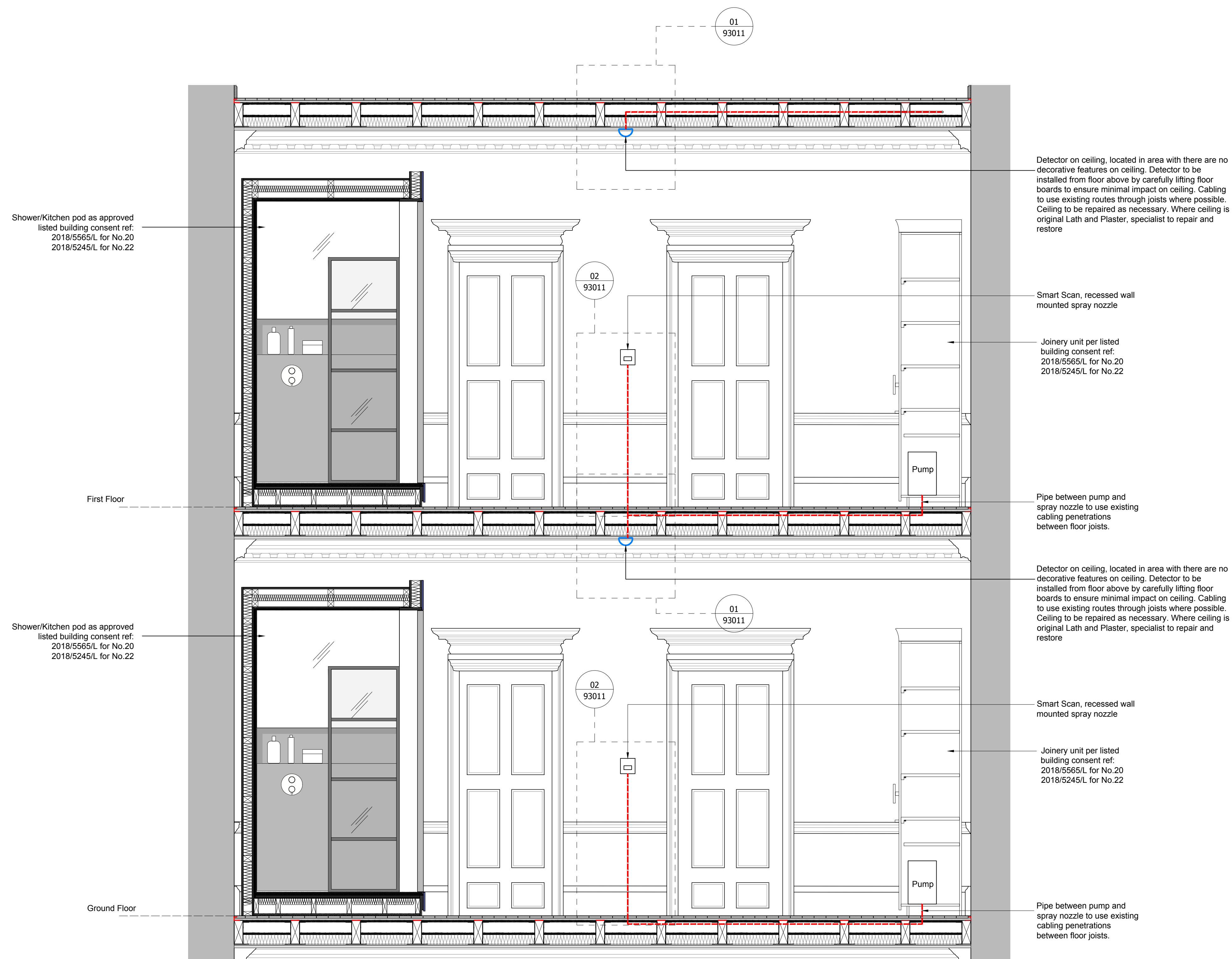
01 Typical Section AA - Through Living Room