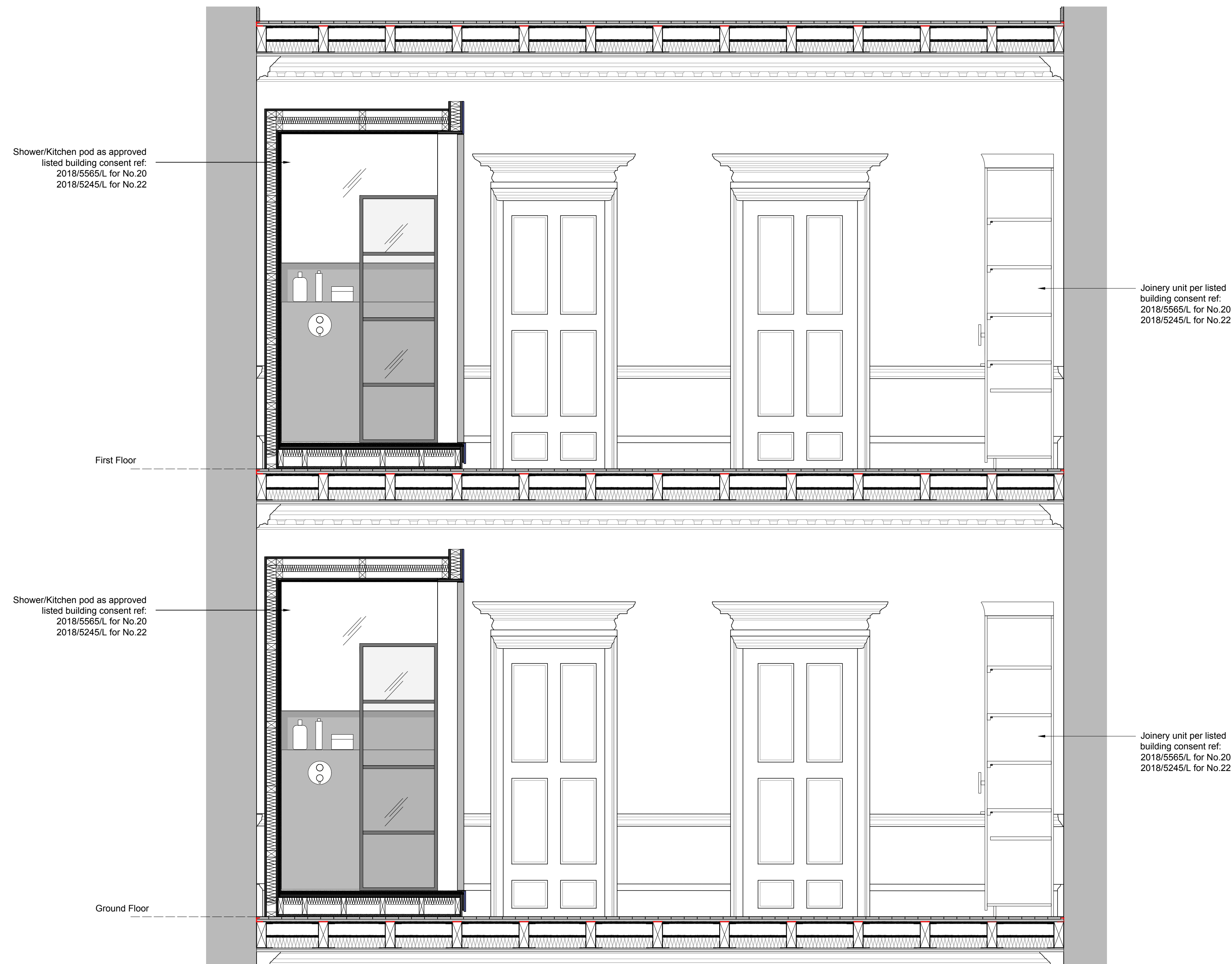
01 Typical Section AA - Through Living Room