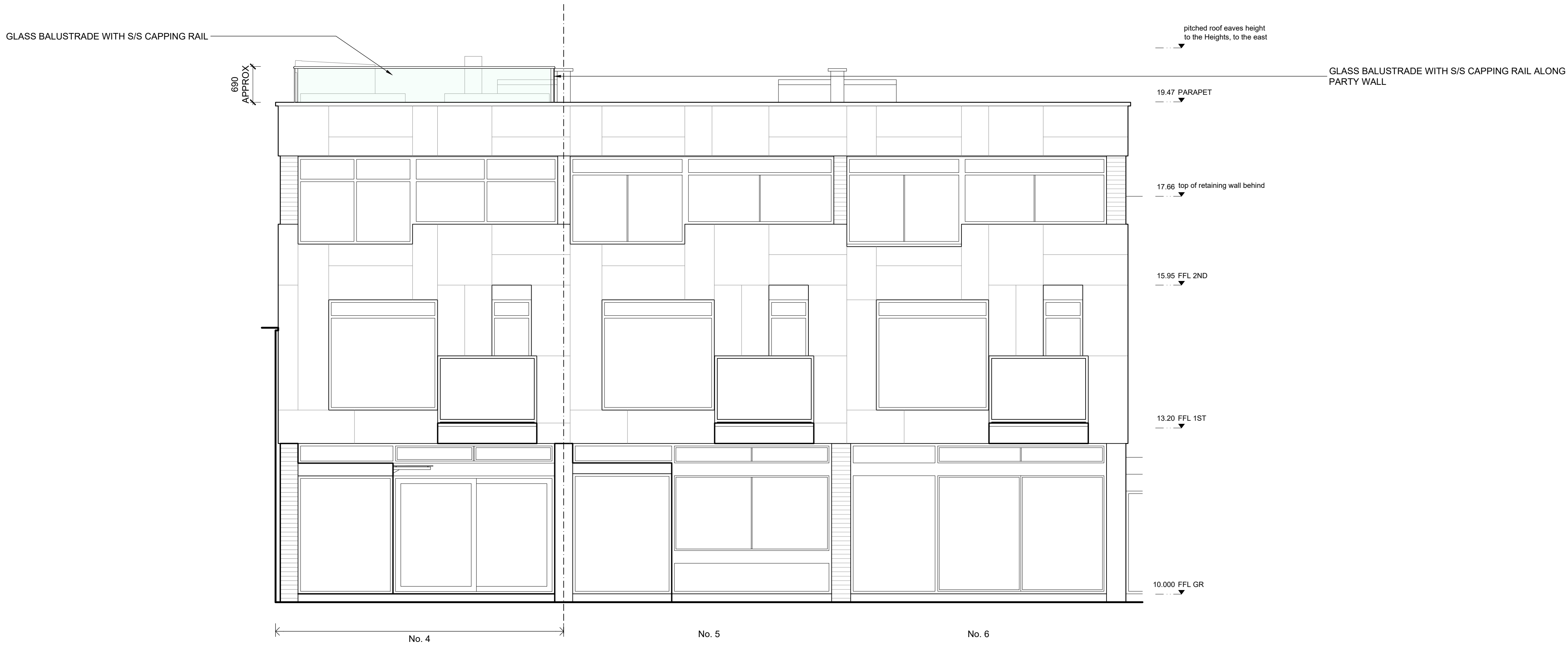
1 PROPOSED SOUTH ELEVATION (AS EXISTING)