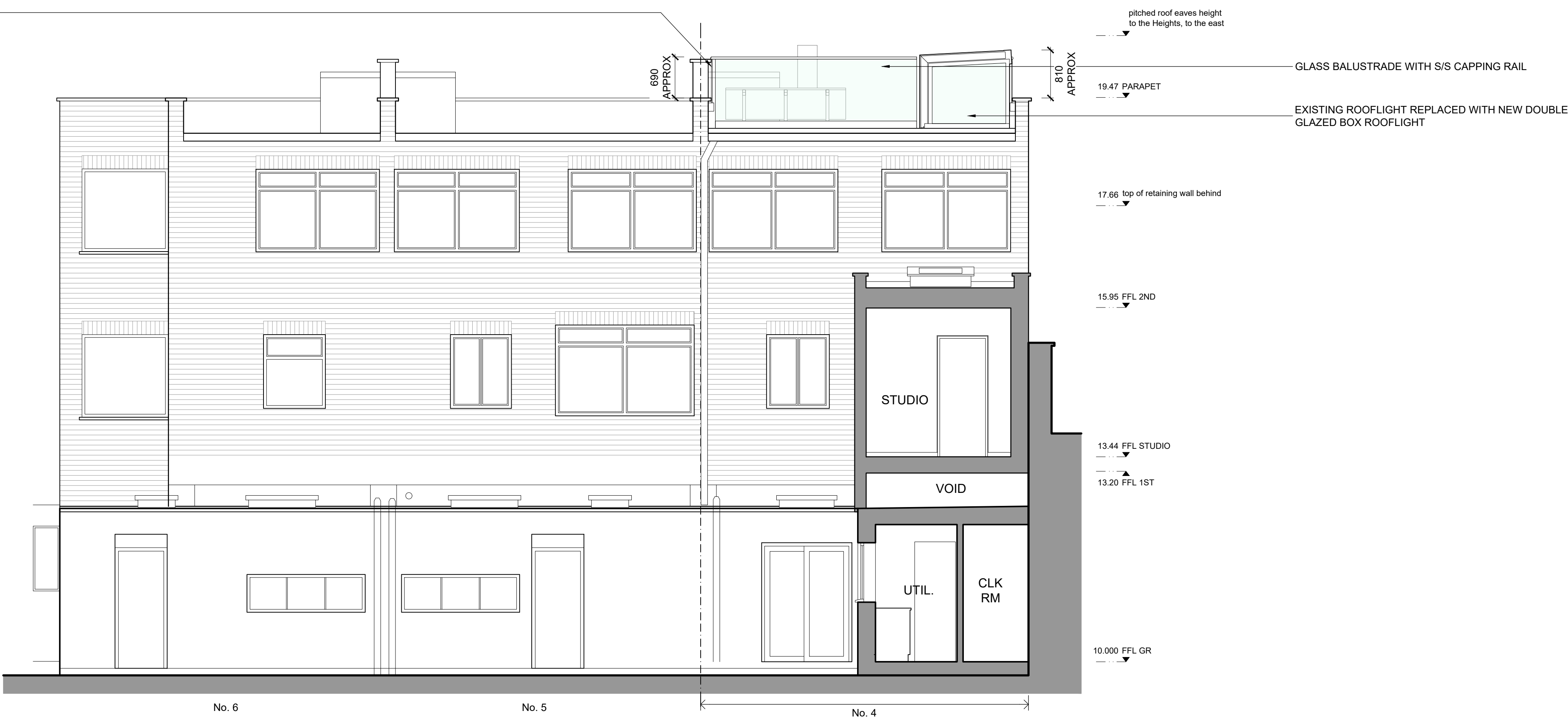
1 PROPOSED NORTH ELEVATION (SECTION CC)

GLASS BALUSTRADE WITH S/S CAPPING RAIL ALONG PARTY WALL