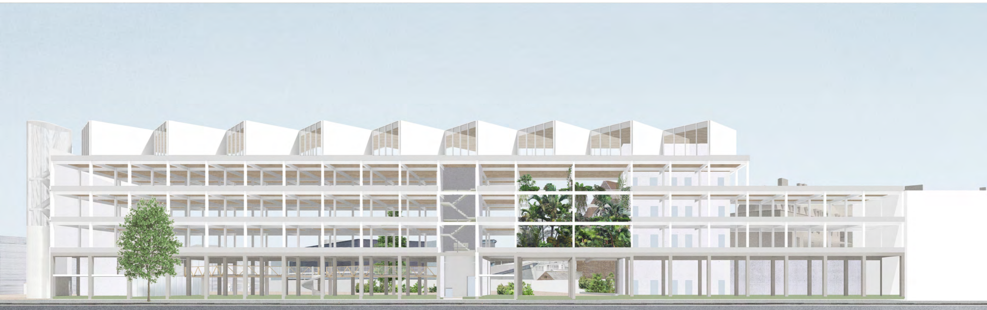
Proposed Greenhouse across the linking bridge