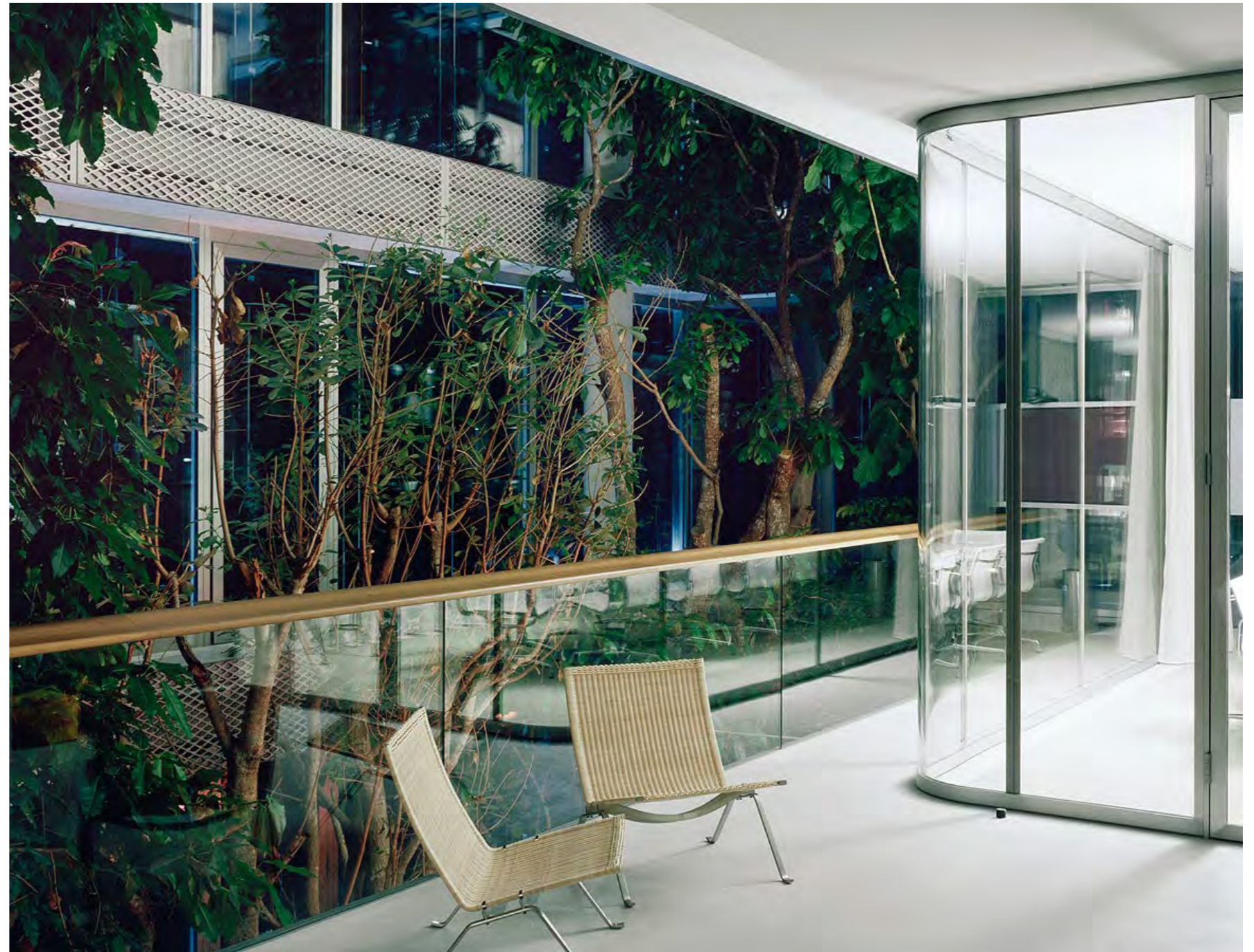
References for Greenhouse Work Spaces