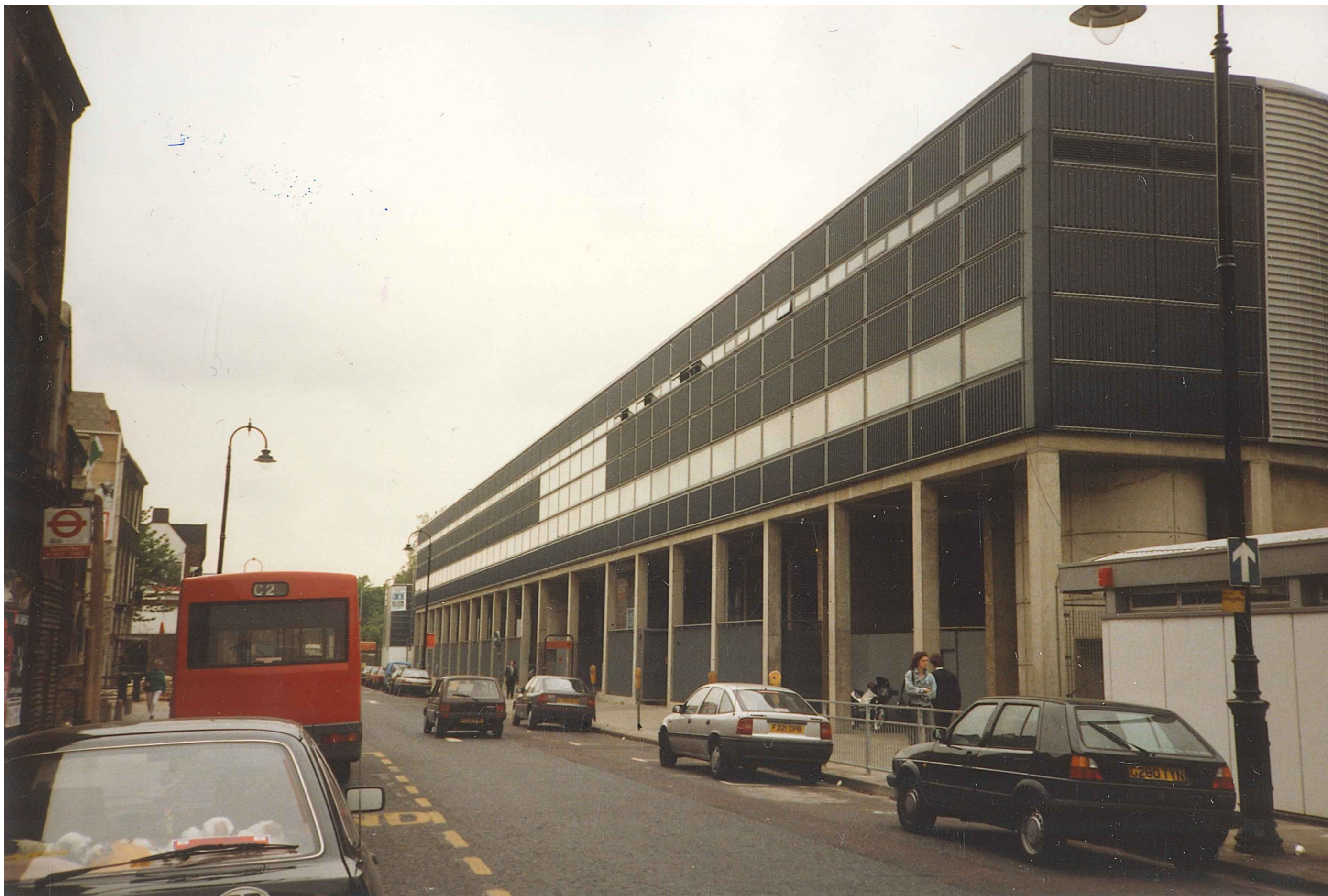
Grand Union House, Archive Photograph, 1990