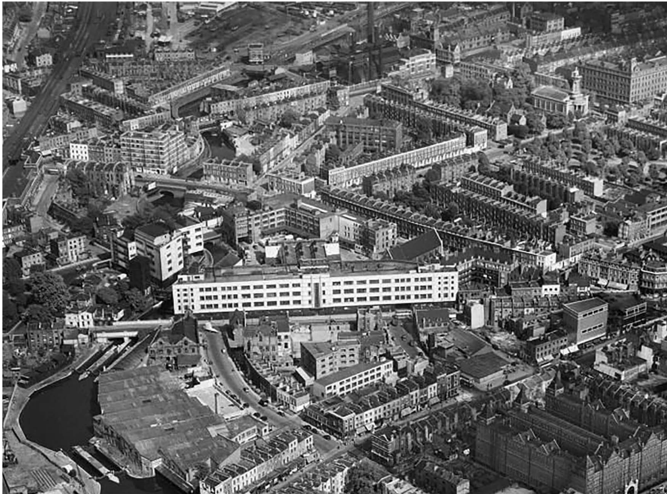
ABC Bakery on Grand Union House site prior to construction of Nicholas Grimshaw's Scheme 1960s