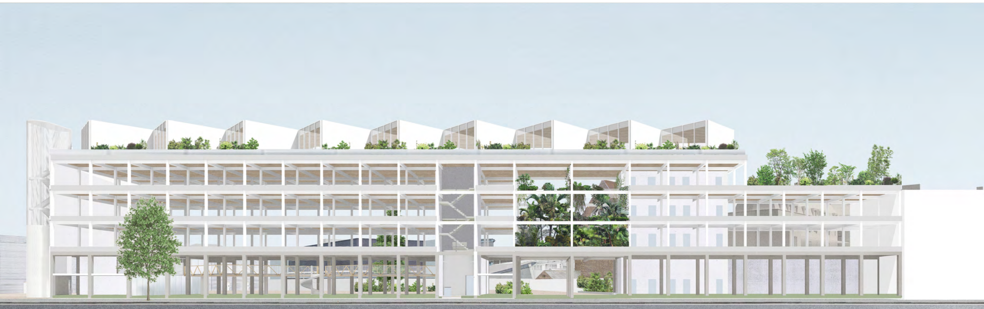
Planted terraces and rooftop garden along Kentish Town Road