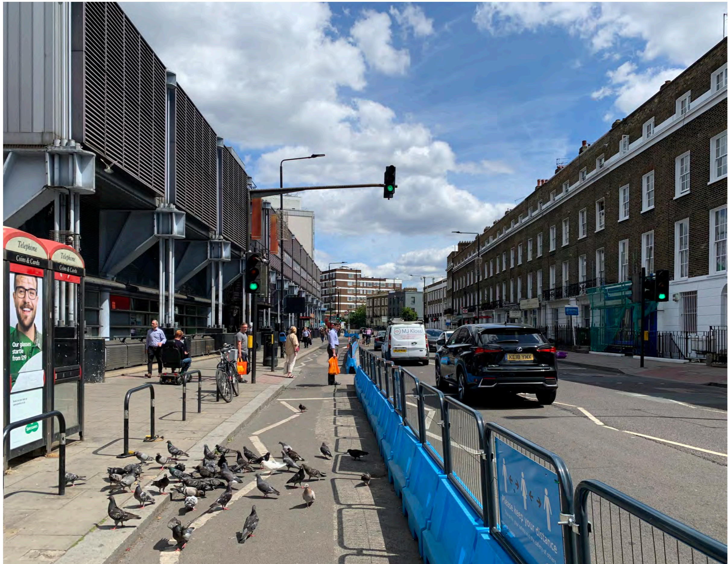
1980s Grade II Listed