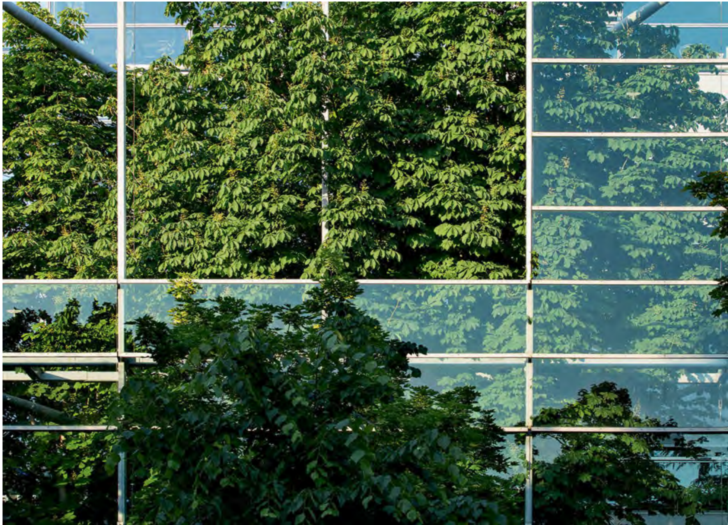
Garden planting within a glazed facade, Ref: Jean Nouvel , Fondation Cartier