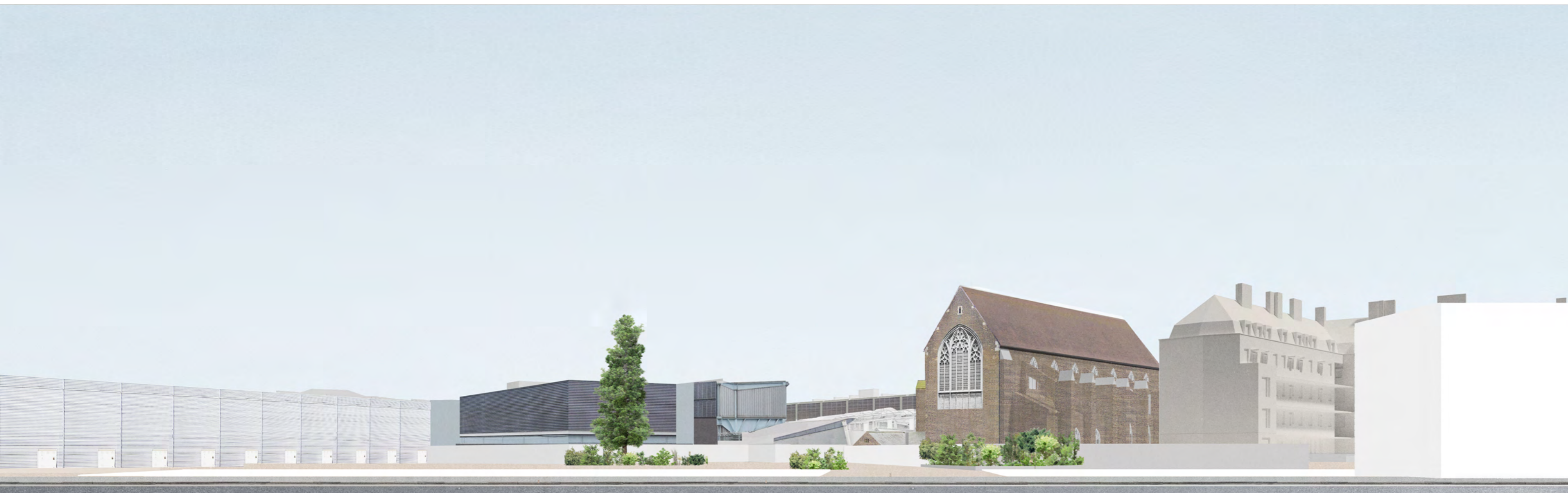
New planting to the service yard