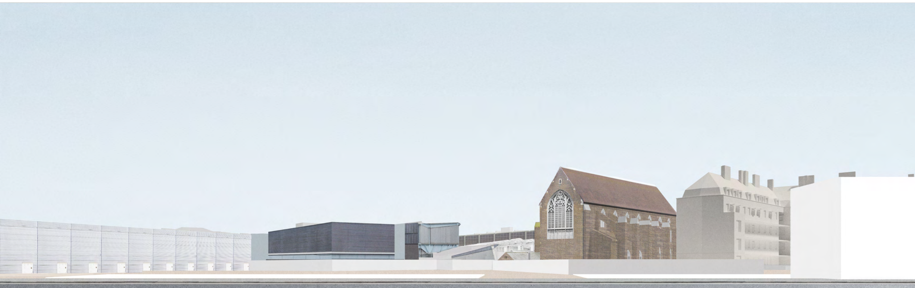
Abstracted view looking towards Sainsbury's loading yard from Kentish Town Road