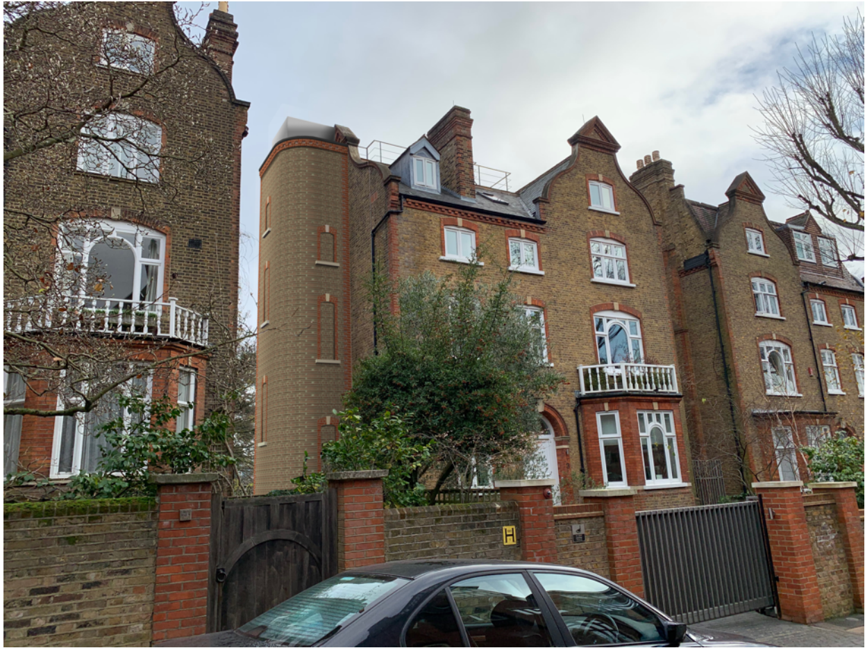
2 Proposed Street Perspective