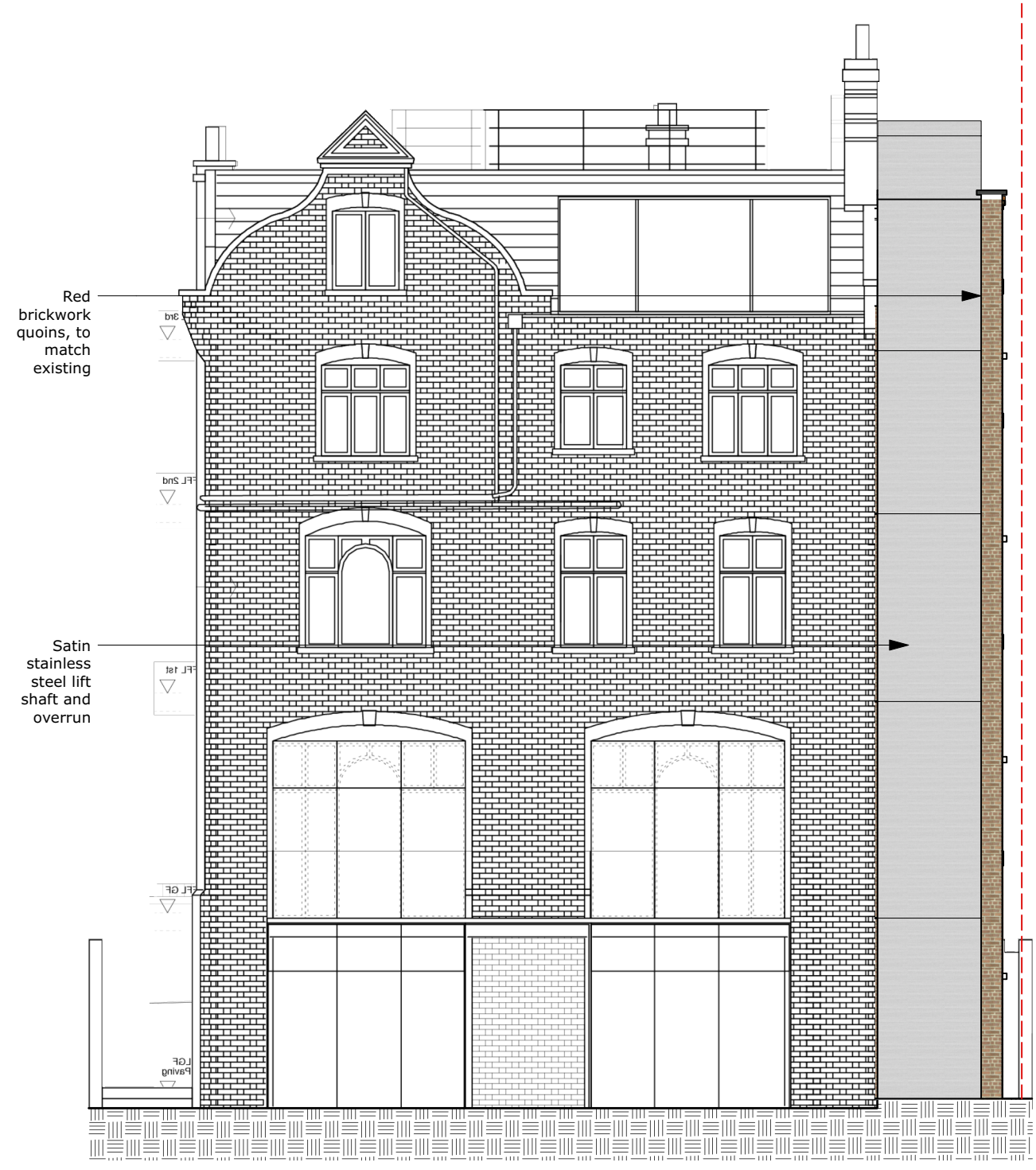
1 East Elevation