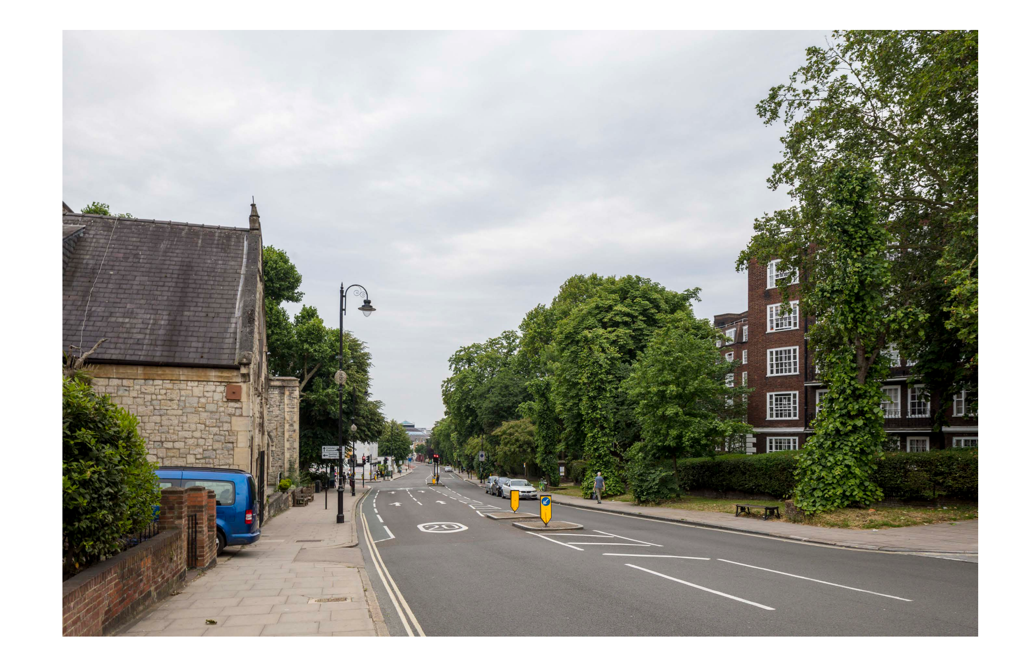
6.1 VIEW FROM HAVERSTOCK HILL