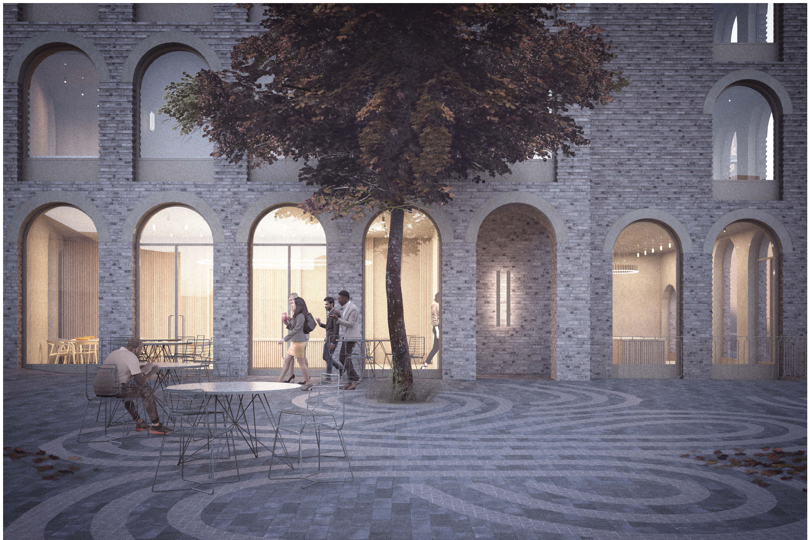
Evening view of main hotel entrance.