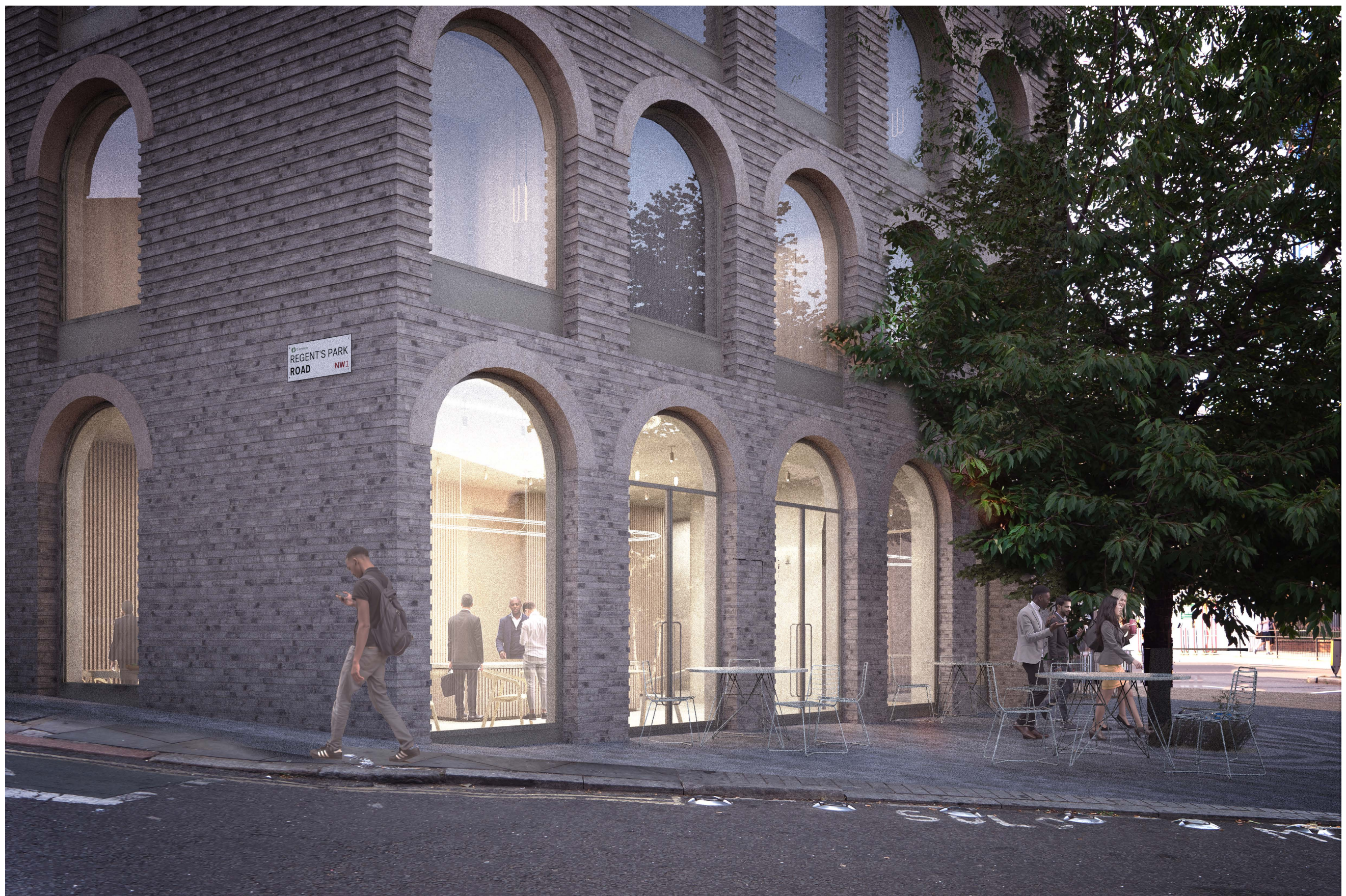
Regent's Park Road corner.