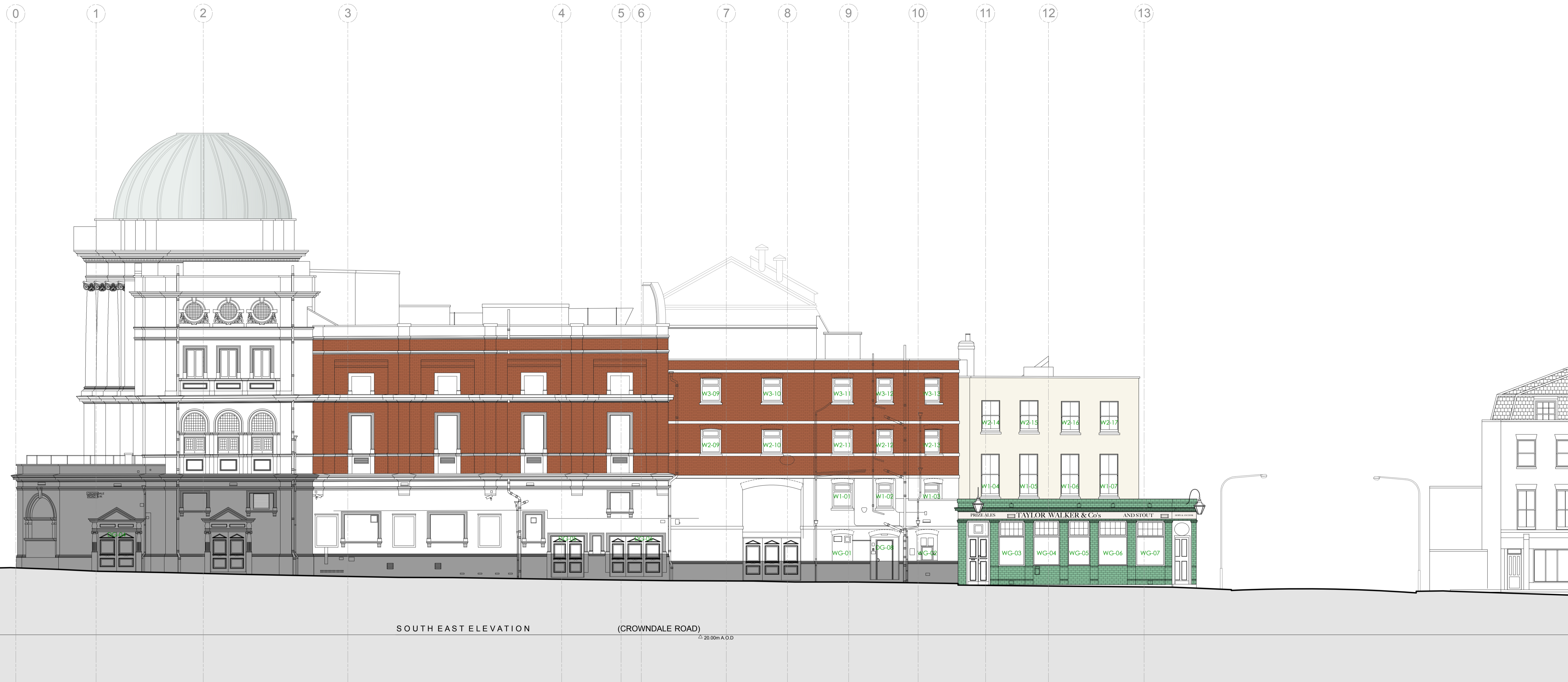
SOUTH EAST ELEVATION (CROWNDALE ROAD) ± 20.00m A.O.D.