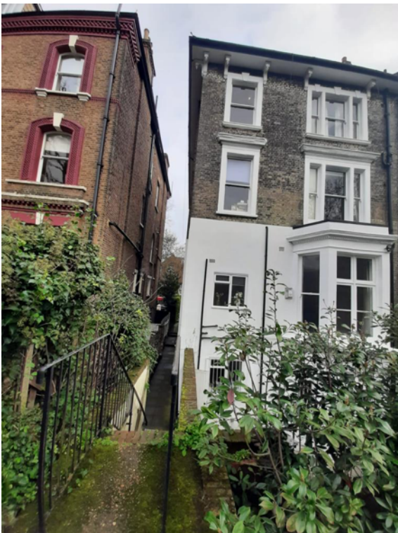
Flat 23B Belsize Avenue rear elevation. Looking at alleyway between No. 23 and No. 25. Existing kitchen window and bay visible.