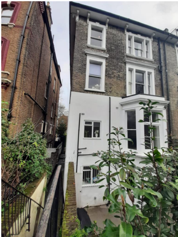
Flat 23B Belsize Avenue rear elevation. Existing kitchen window, bay and lightwell visible