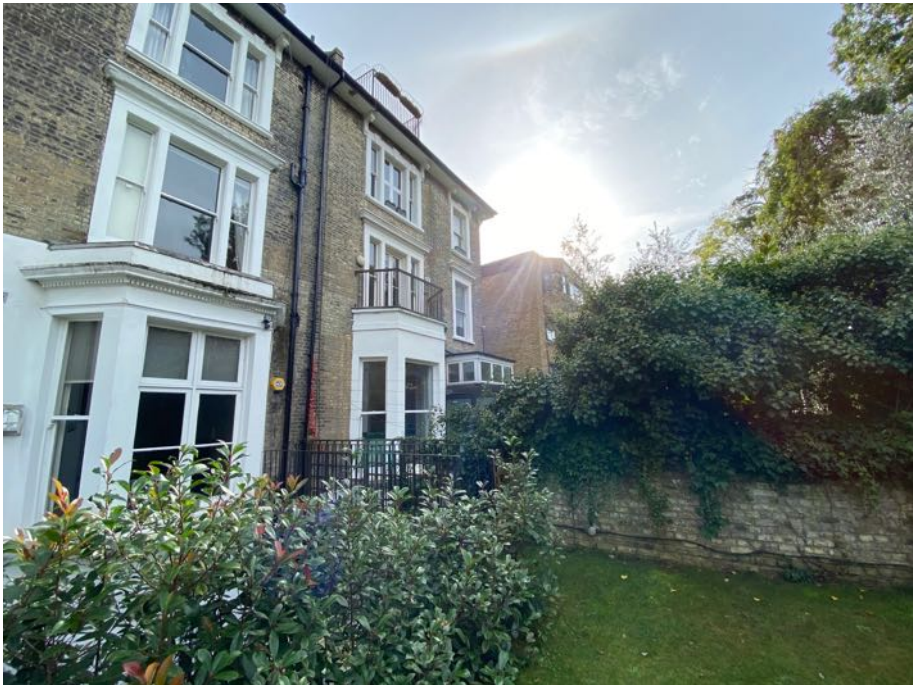
Flat 23B Belsize Avenue rear elevation (left). Bay windows visible