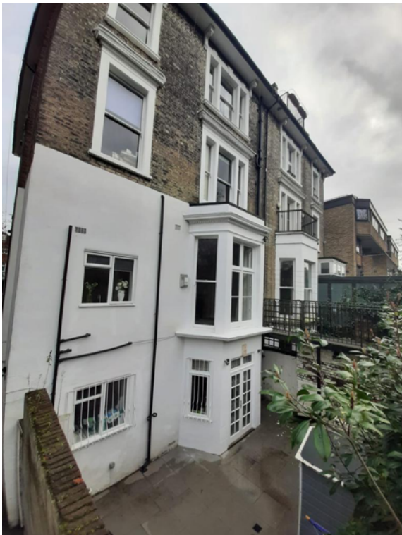
Flat 23B Belsize Avenue rear elevation. Looking at lightwell below Flat 23B.