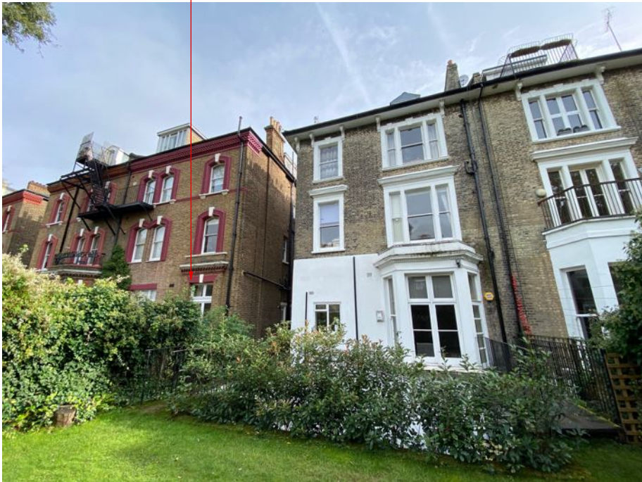
Flat 23B Belsize Avenue rear elevation (centre). Kitchen window, bay windows, French door and metal walkway visible

neighbouring property's French doors with fixed windows over and Juliette balcony, all above lightwell