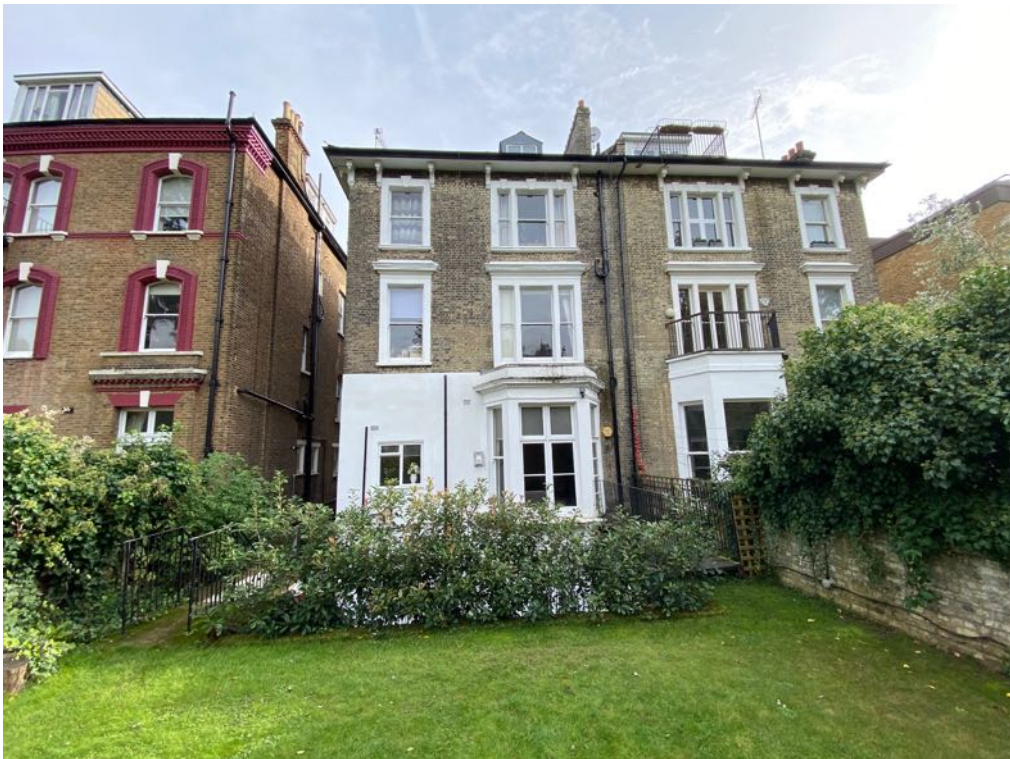
Flat 23B Belsize Avenue rear elevation (centre). Existing kitchen window and bay visible