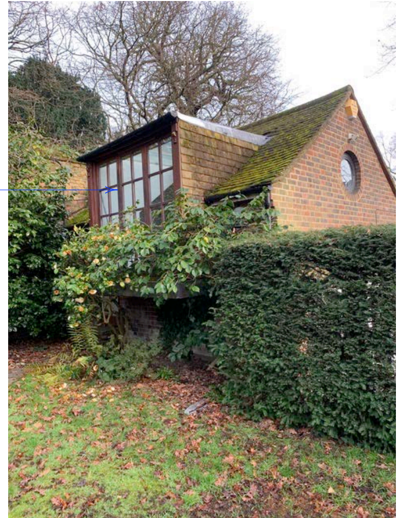
West elevation (rear garden facing)

Replacement of doors with timber french door and sash windows