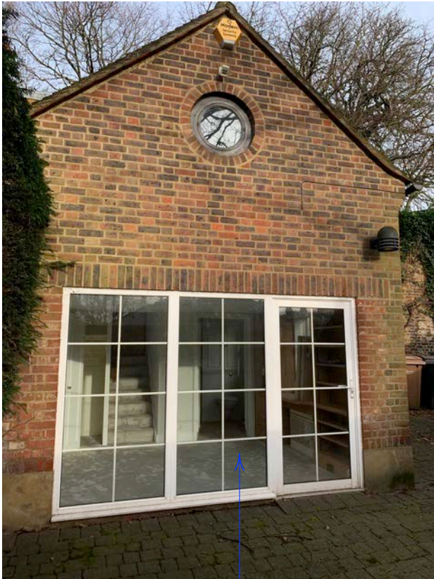
South elevation (rear patio facing)

Replacement of uPVC door and glazed panels with timber french door and sash windows