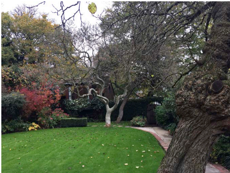
Garden building view from rear garden