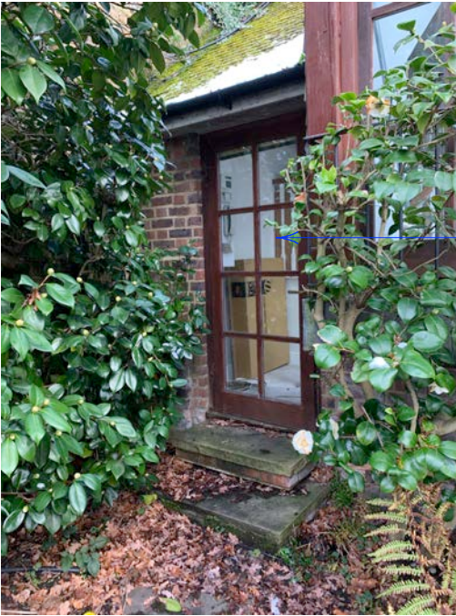
Door on west elevation (rear garden facing)

Raise up door cill level and change from door to timber sash window