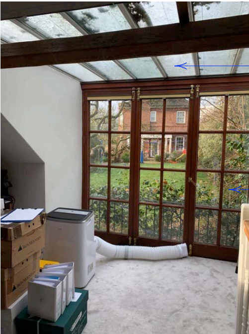
Glazed dormer roof and french doors

Replacement of doors with timber french doors and sash windows