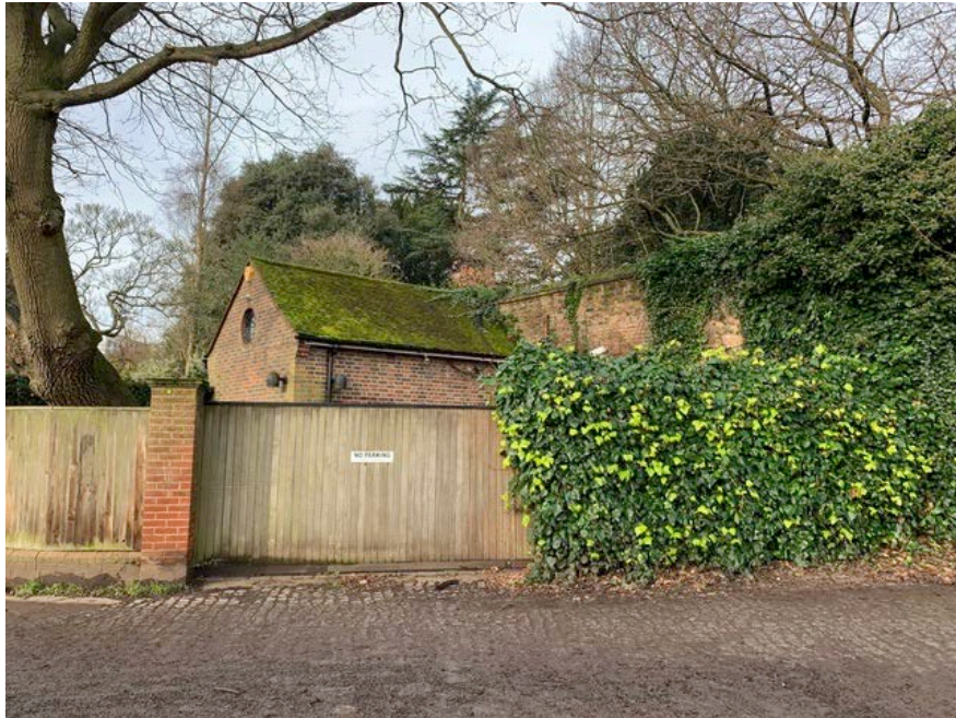
Garden building view from Frogmal Way