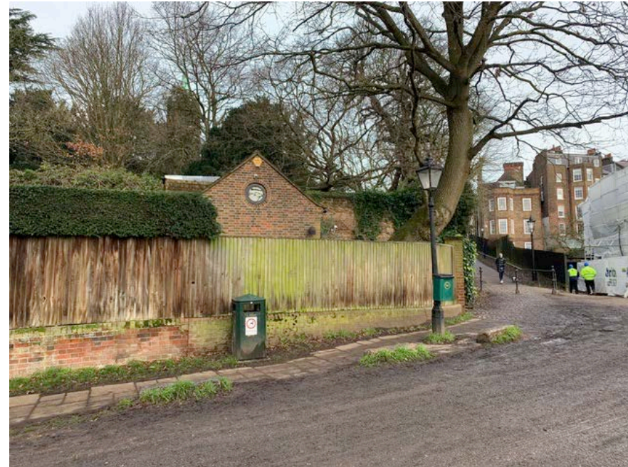
Garden building view from Frogmal Way