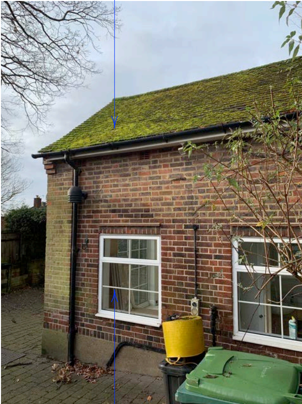
East elevation (rear patio facing)

Re-roofing with matching roof tiles and replacement of leadwork flashing to match existing