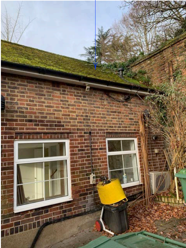
East elevation (rear patio facing)

Replacement of uPVC door and glazed panels with timber french door and sash windows