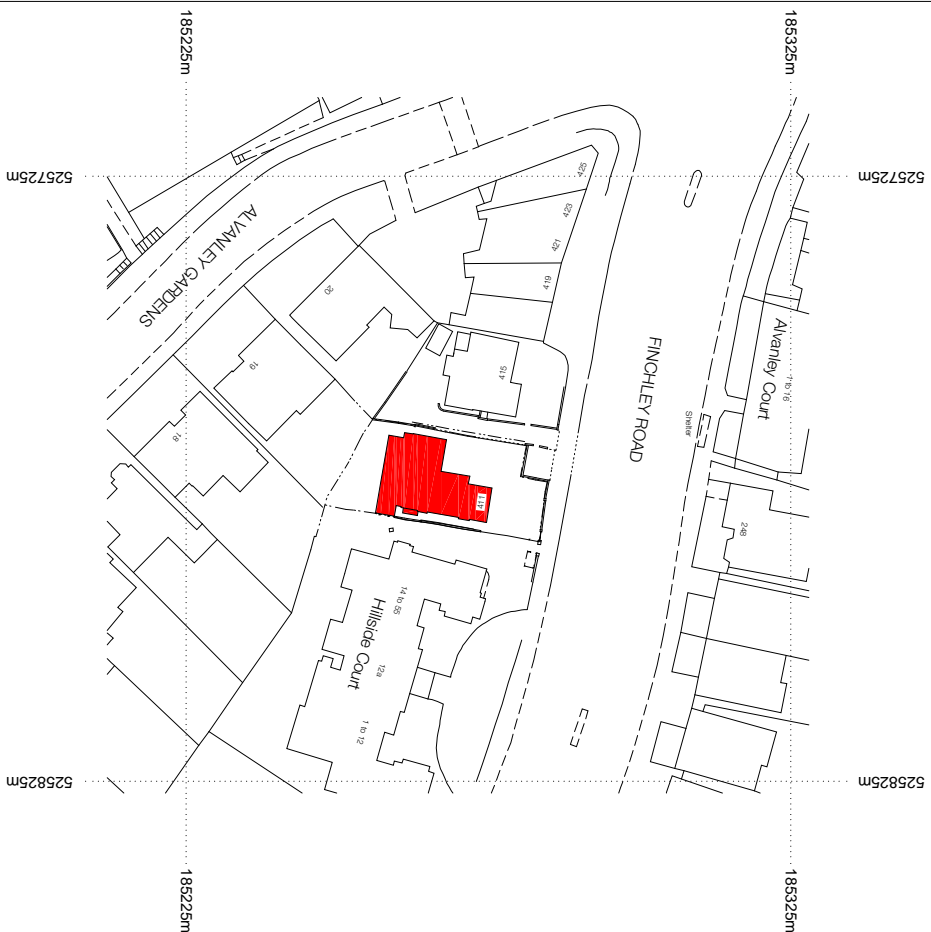
Ordnance Survey (© Crown Copyright 2017. All rights reserved. Licence number 100022432) 0 25 50m Location Plan scale 1:1250