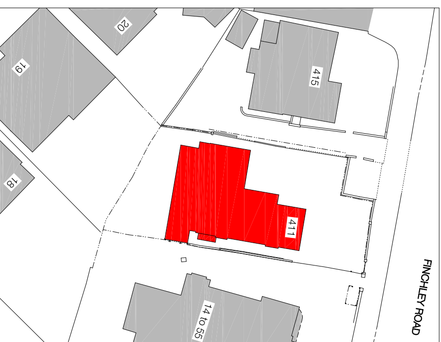
0 10 20m Block Plan scale 1:500