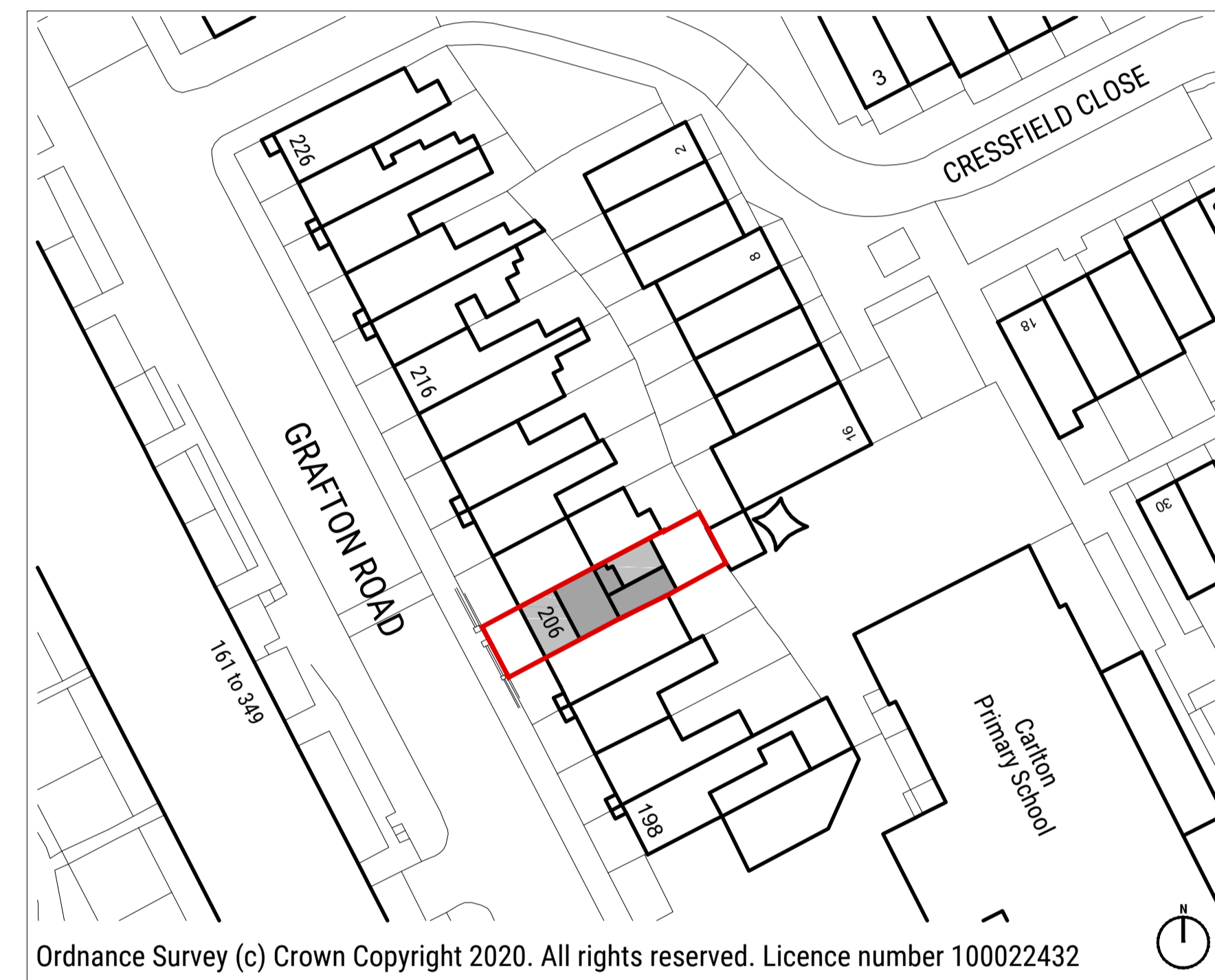
02 Block Plan Scale 1:500@A1