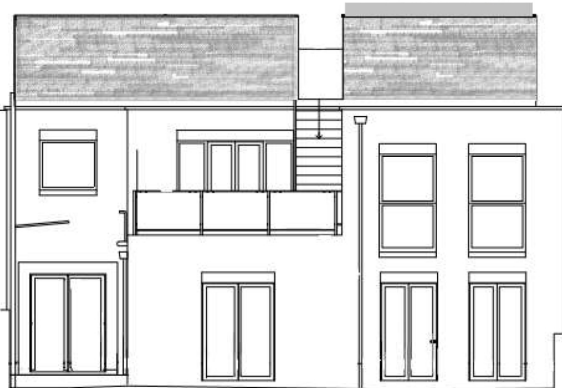
South Rear Elevation

Home office in roof garden at 17 Albert Terrace Mews, London, NW1 7TA