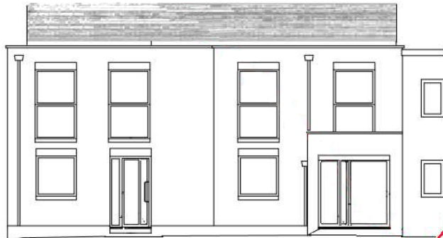
North Front Elevation

The studio is not visible from the front of the property