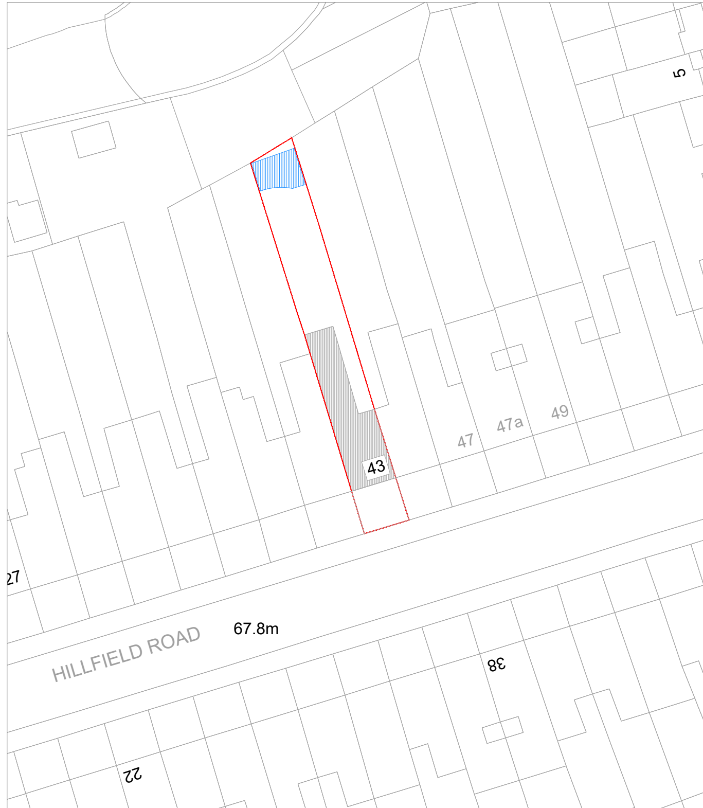
Block Plan - Scale: 1:500