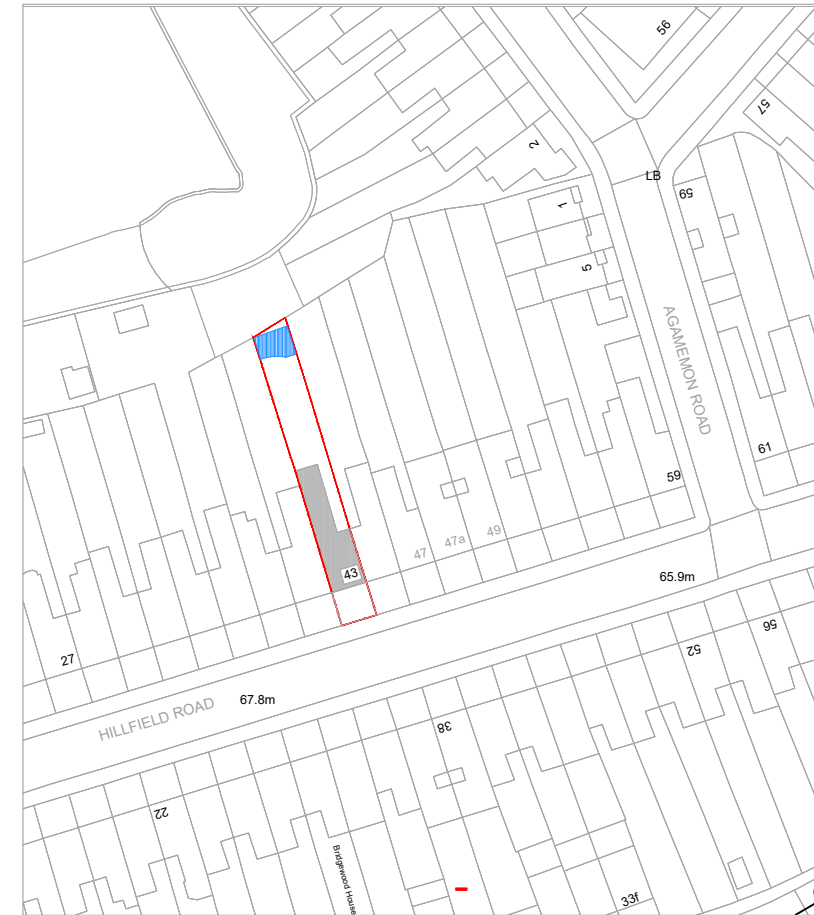
Site Plan - Scale: 1:1250