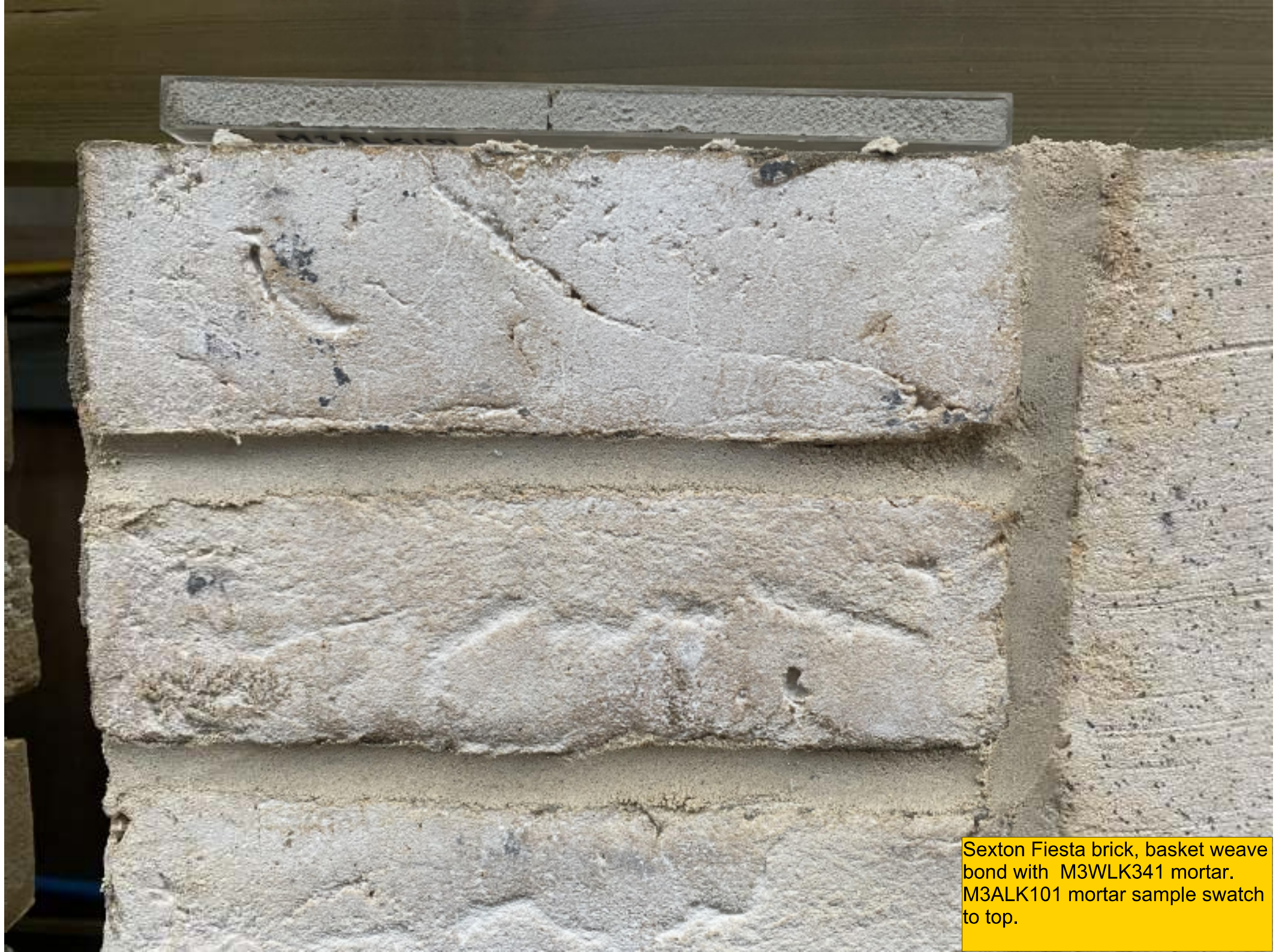
Sexton Fiesta brick, basket weave bond with M3WLK341 mortar. M3ALK101 mortar sample swatch to top.