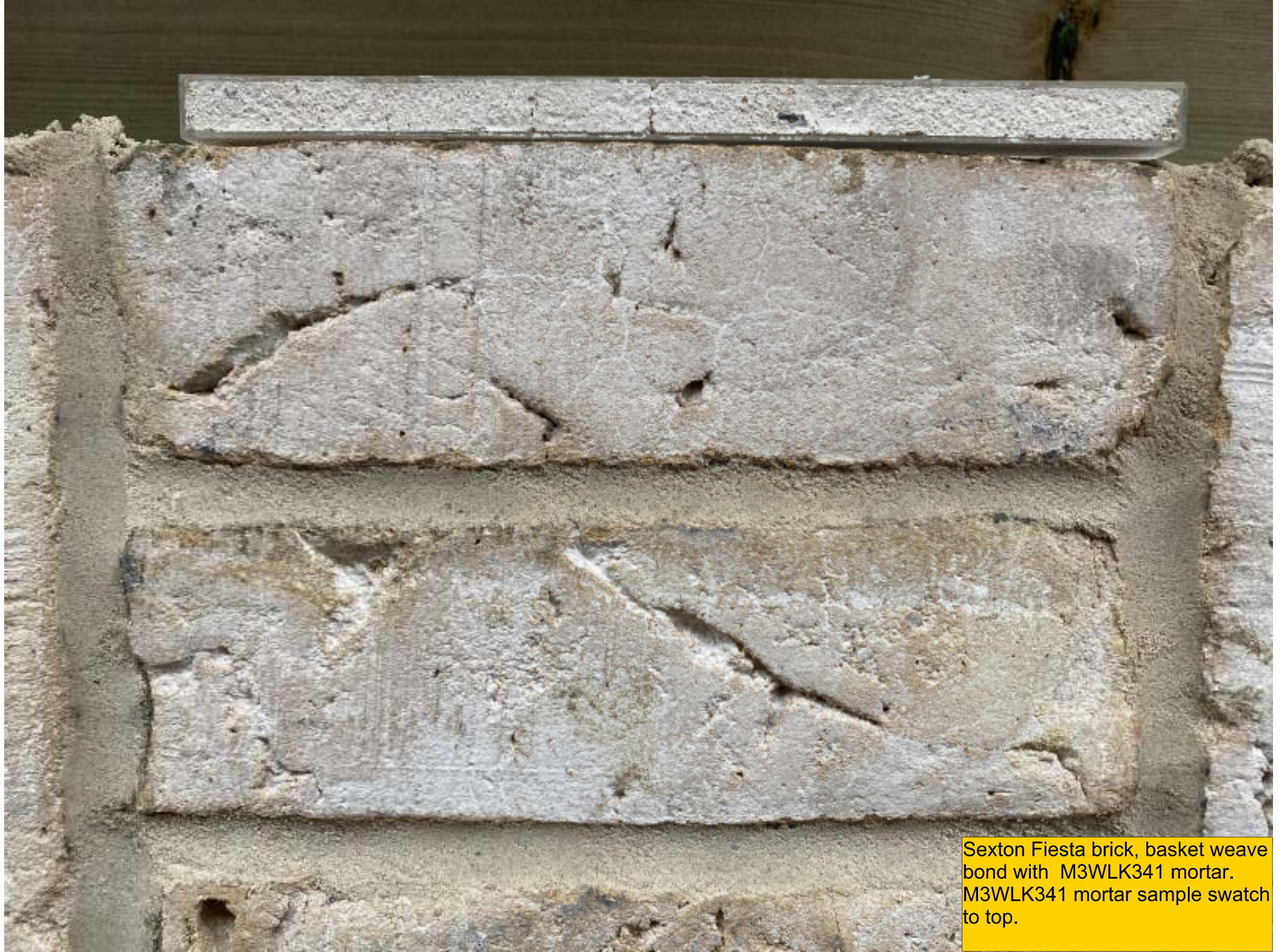
Sexton Fiesta brick, basket weave bond with M3WLK341 mortar. M3WLK341 mortar sample swatch to top.