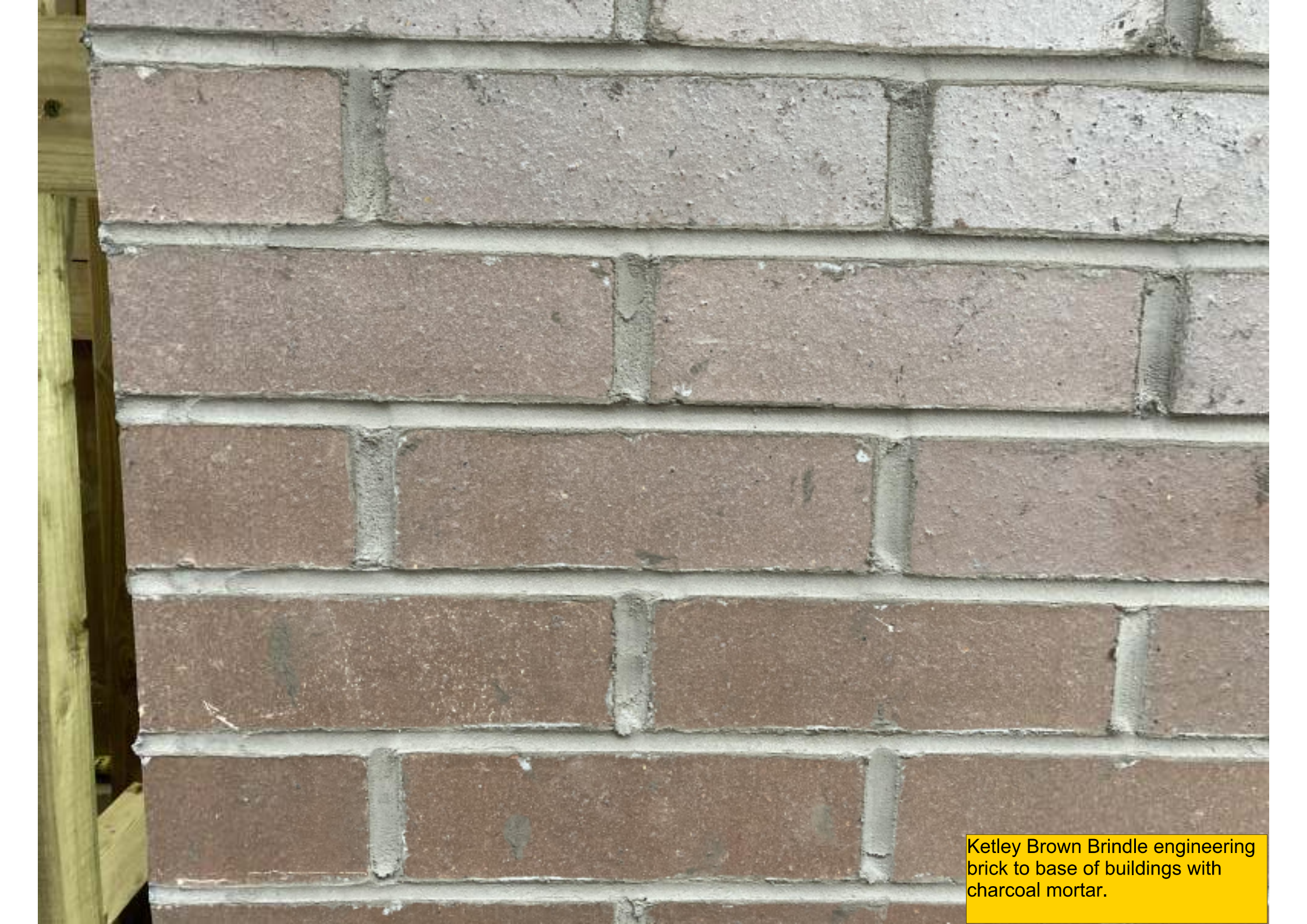
Ketley Brown Brindle engineering brick to base of buildings with charcoal mortar.