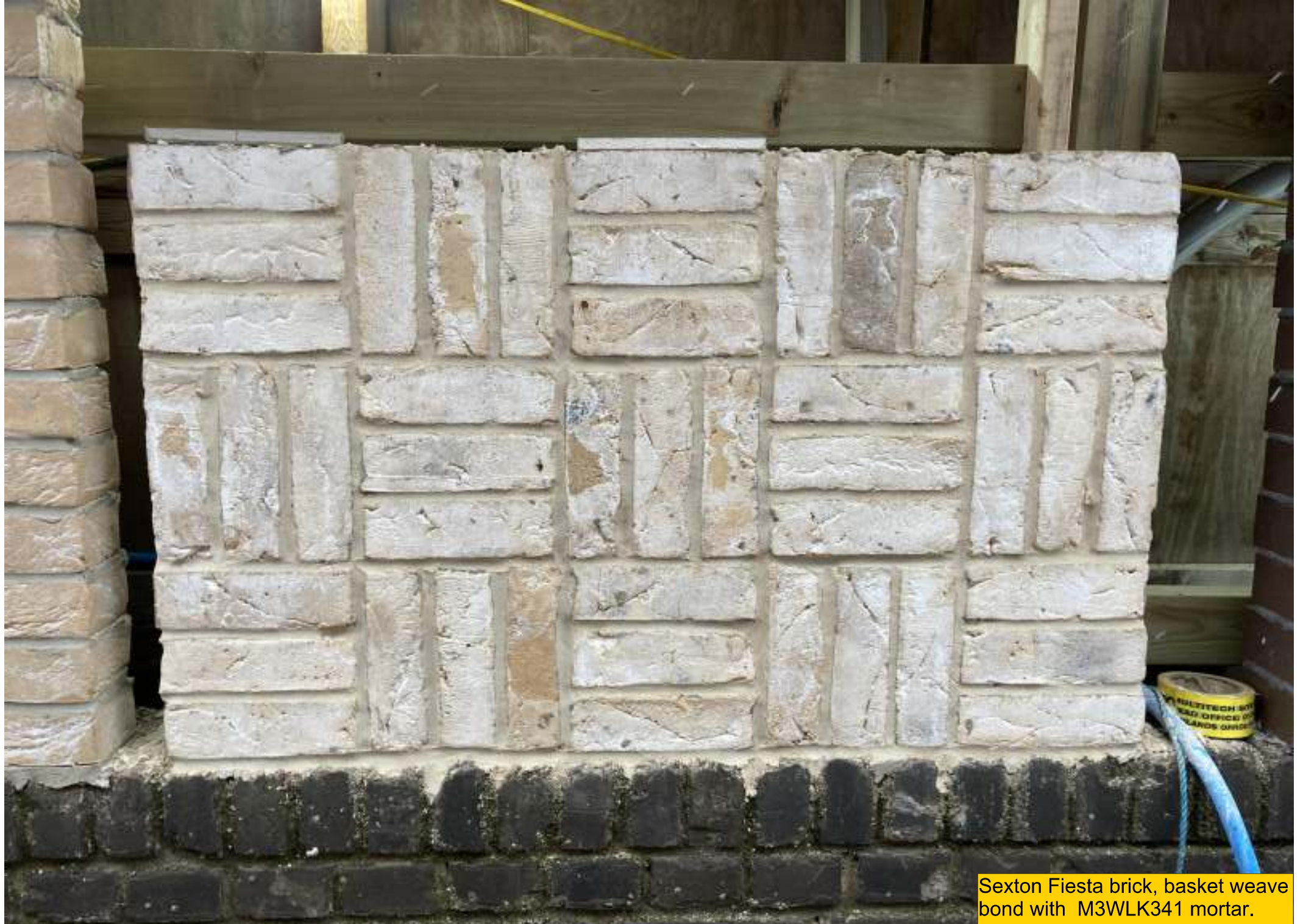
Sexton Fiesta brick, basket weave bond with M3WLK341 mortar.