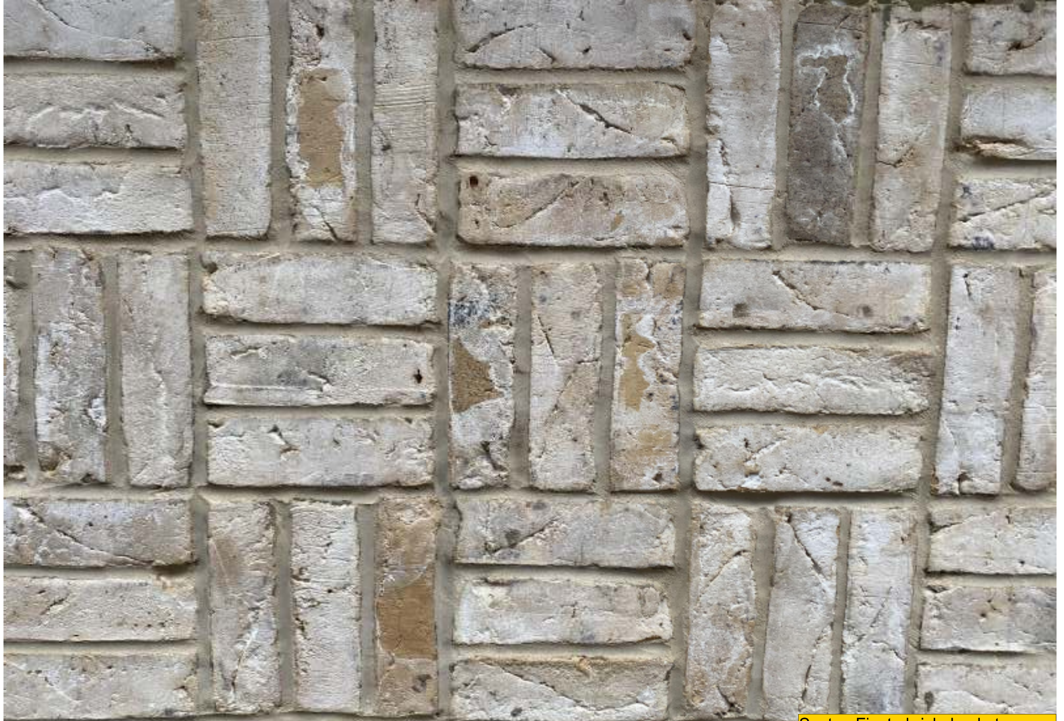
Sexton Fiesta brick, basket weave bond with M3WLK341 mortar.