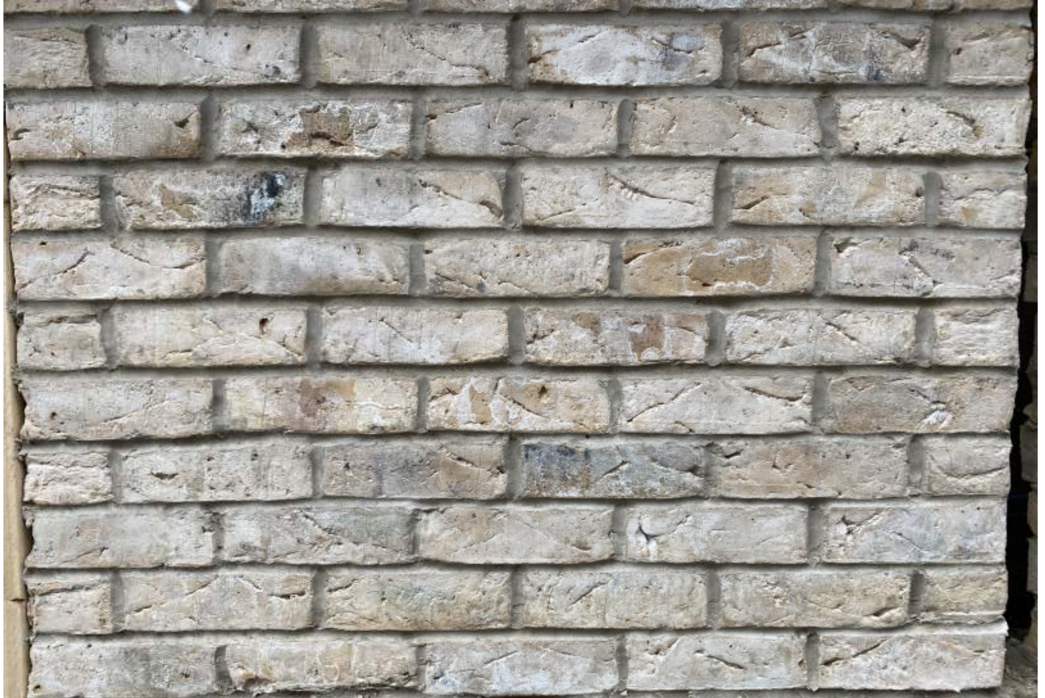
Sexton Fiesta brick, half lap stretcher bond with M3ALK101 mortar.