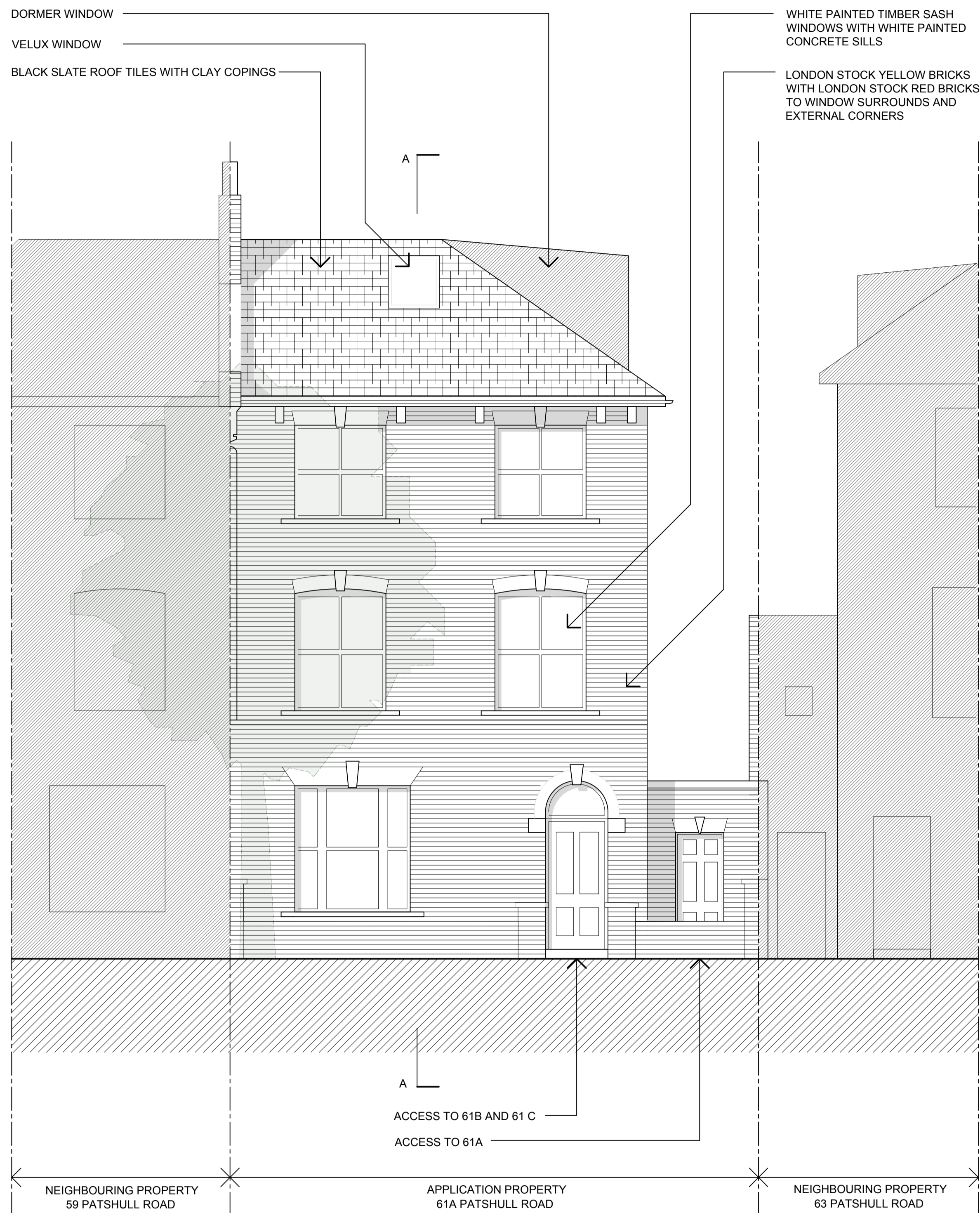
EXISTING FRONT ELEVATION [SOUTH FACING]