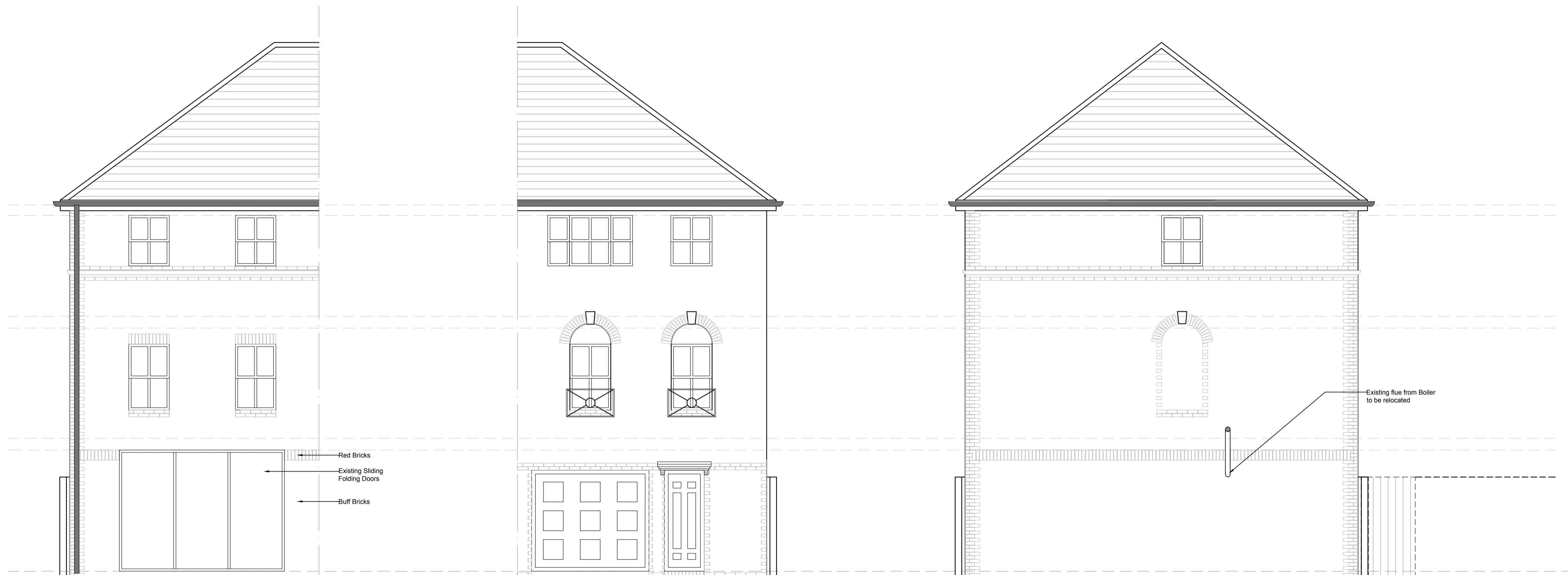
1 1:50 REAR ELEVATION E 200 EXISTING