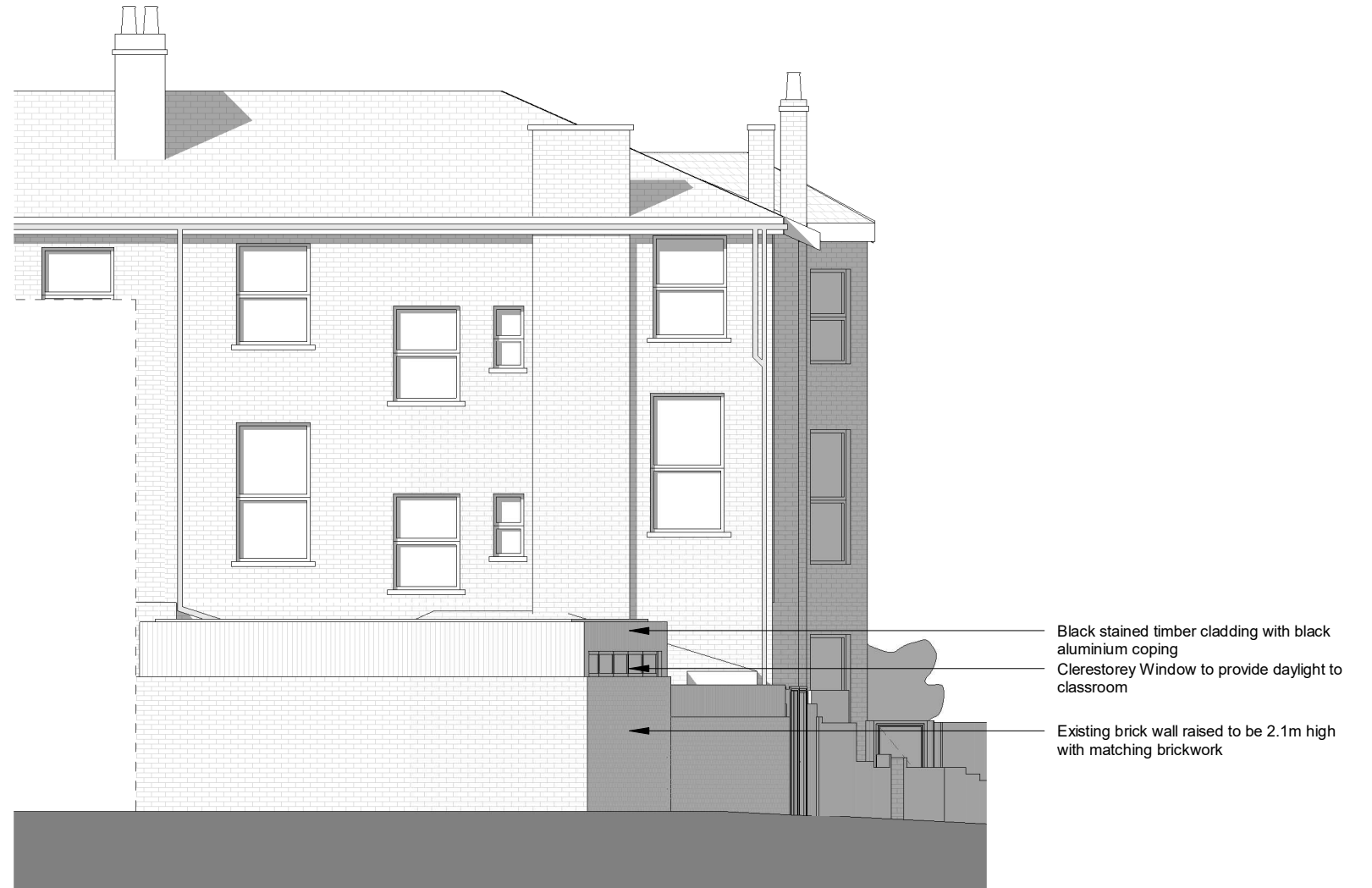
2 Proposed Garden Building - Rear Elevation 1 : 100