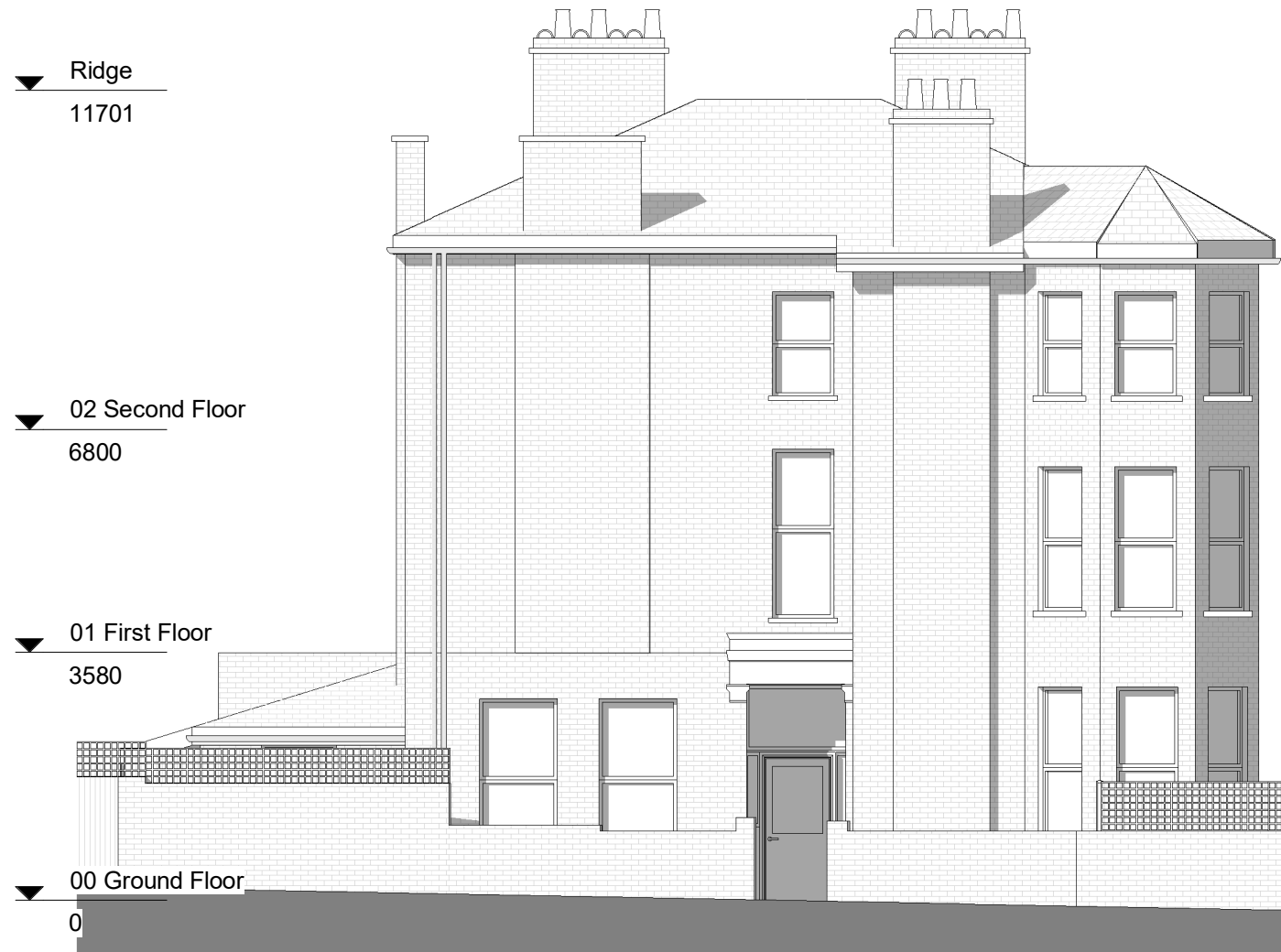
1 Proposed North West Elevation 1 : 100