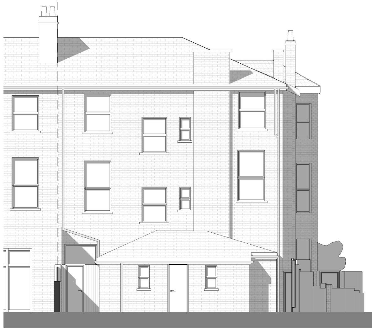
2 Proposed North East (Rear) Elevation 1 : 100