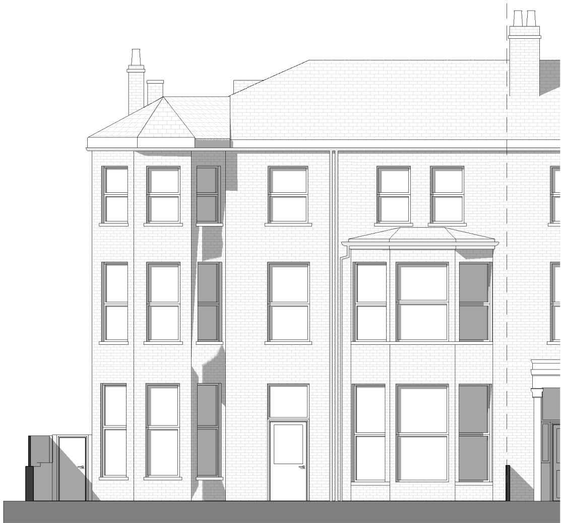
1 Proposed Front Elevation 1 : 100