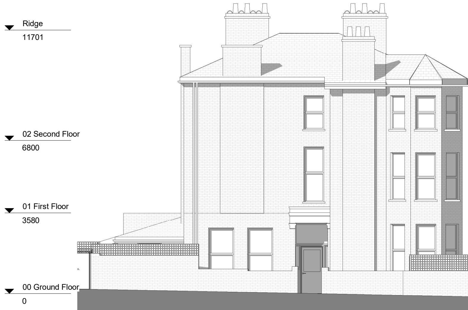
① Existing North West Elevation 1 : 100