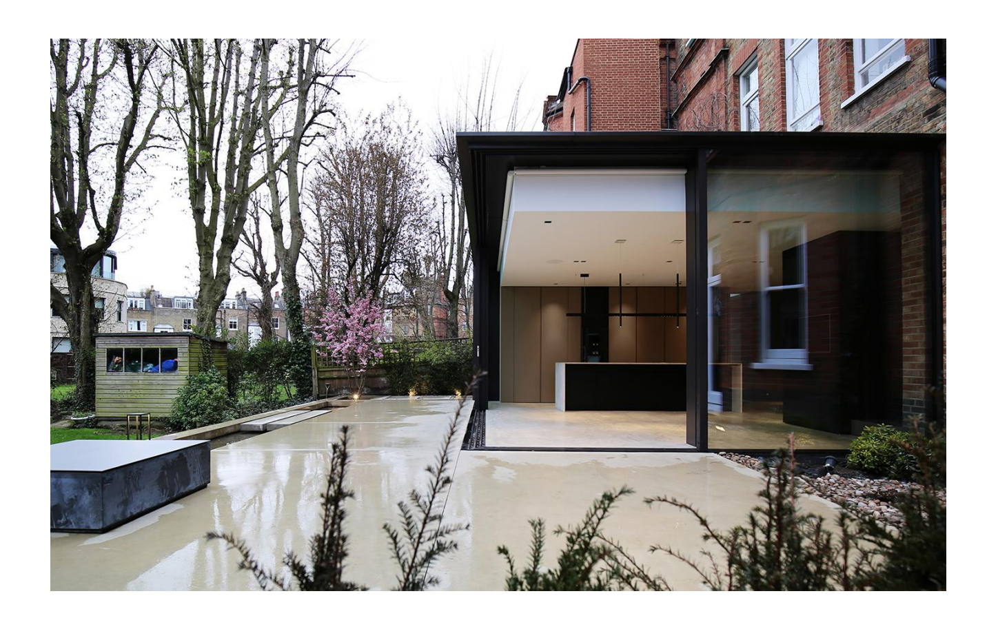
Lawn road NW3 2XB