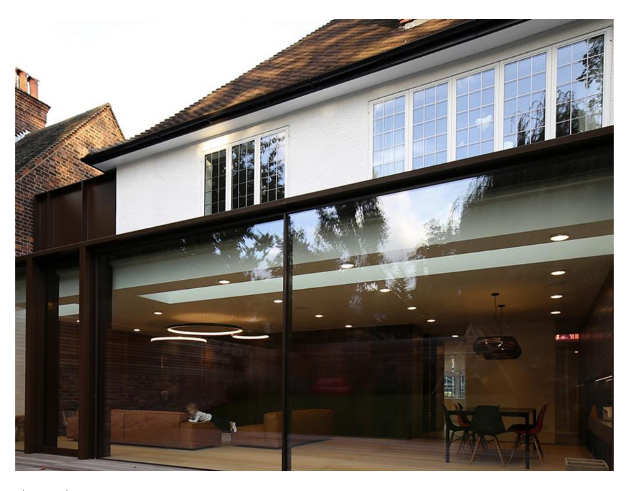
Elms road SW4 9EP