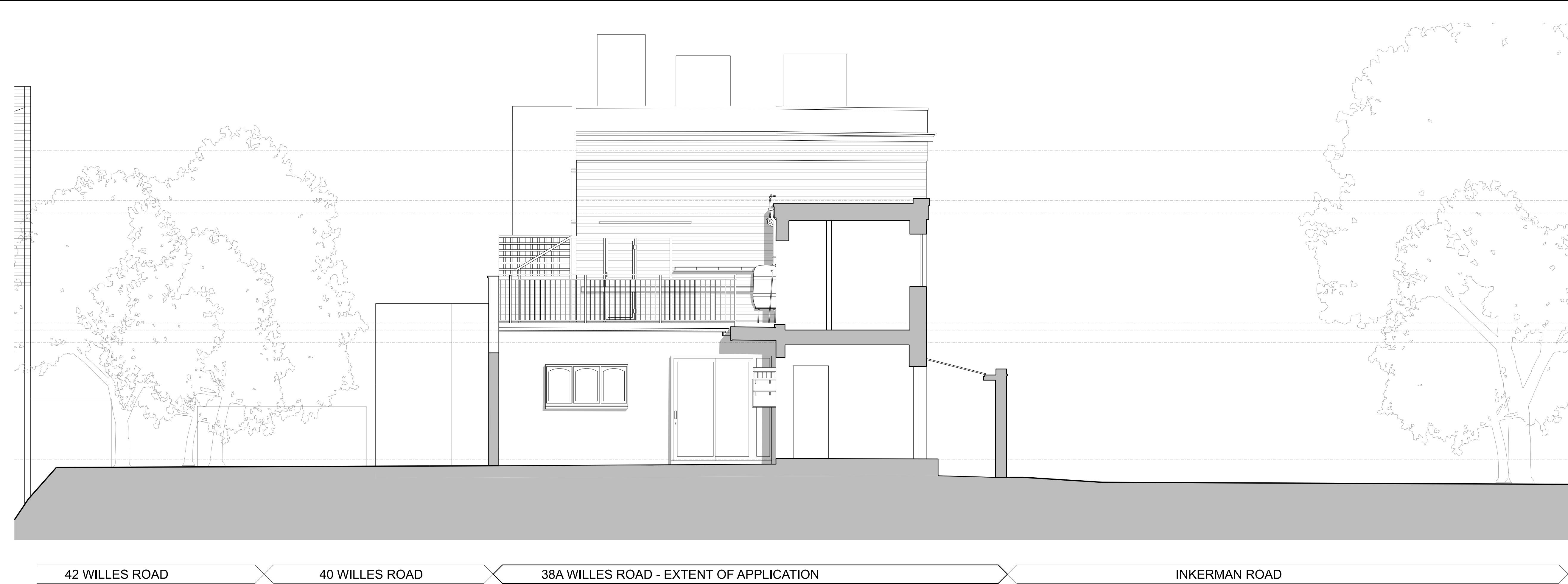
01 SECTION AA - THROUGH EXISTING INTERIOR COURTYARD