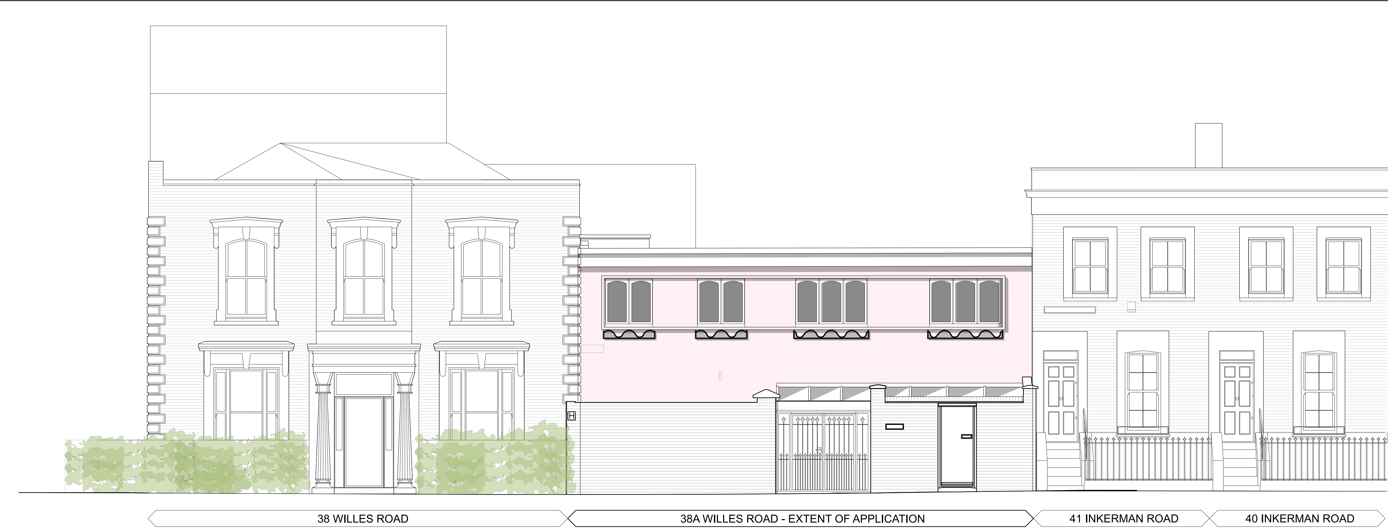
01 EXISTING INTERIOR COURTYARD ELEVATION