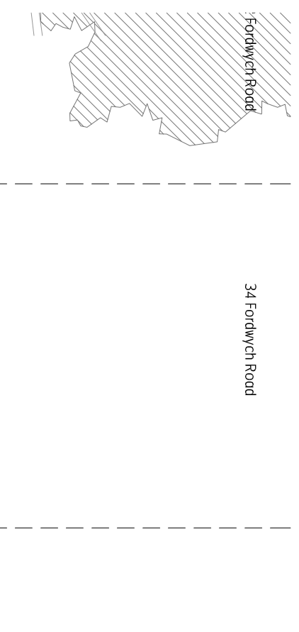
Proposed East Elevation From House | 1:100 at A3