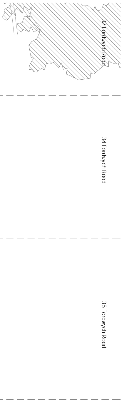
Proposed East Elevation | 1:100 at A3