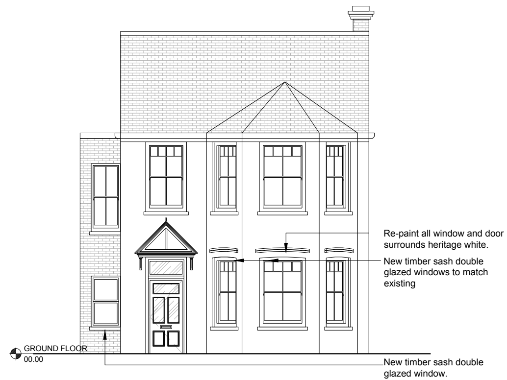
2 PROPOSED FRONT ELEVATION Scale: 1:100