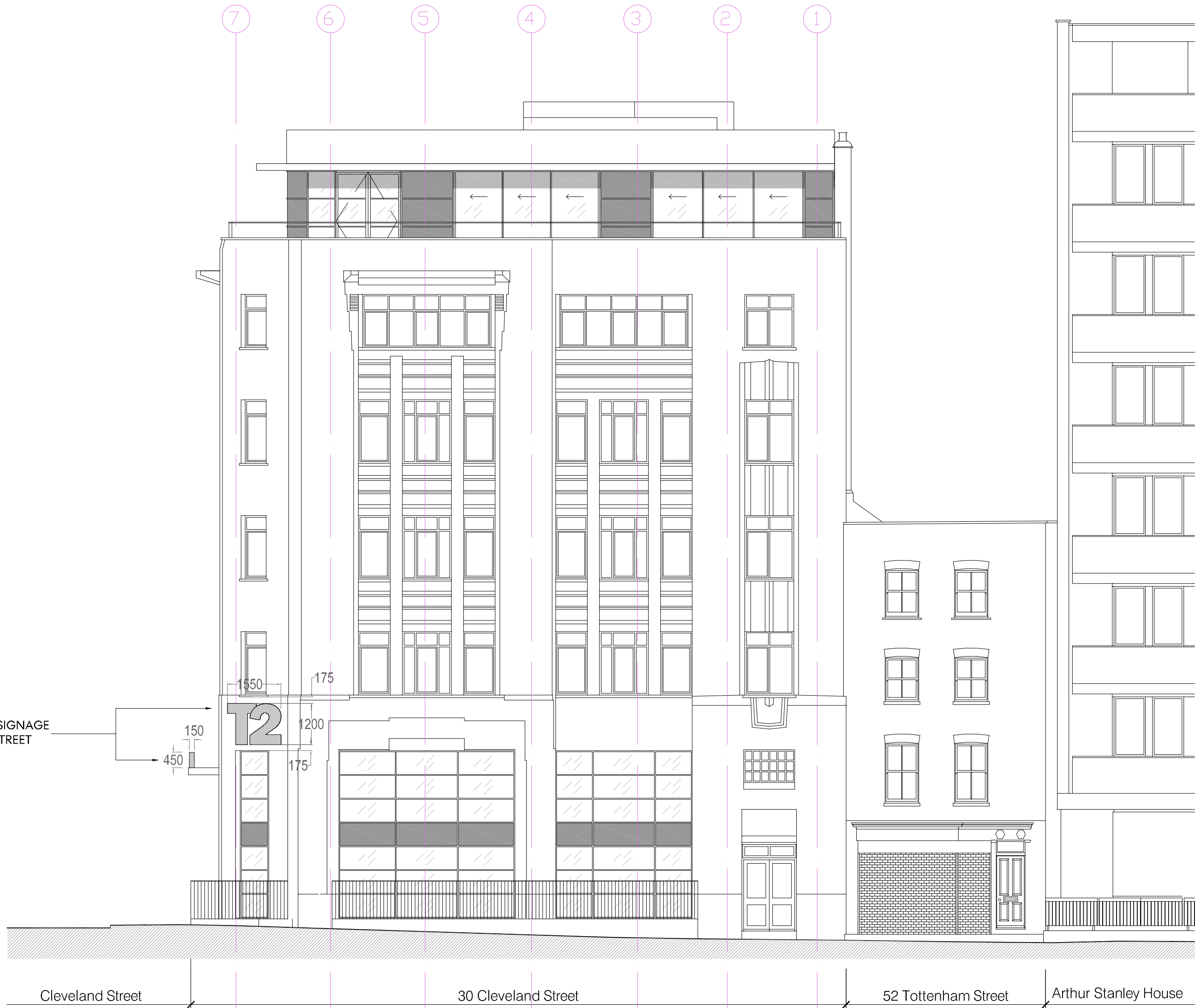
1 PROPOSED SOUTH-EAST ELEVATION 1 : 100

PROPOSED PLANNING APPLICATION FOR SIGNAGE TO MAIN ELEVATION ON 30 CLEVELAND STREET